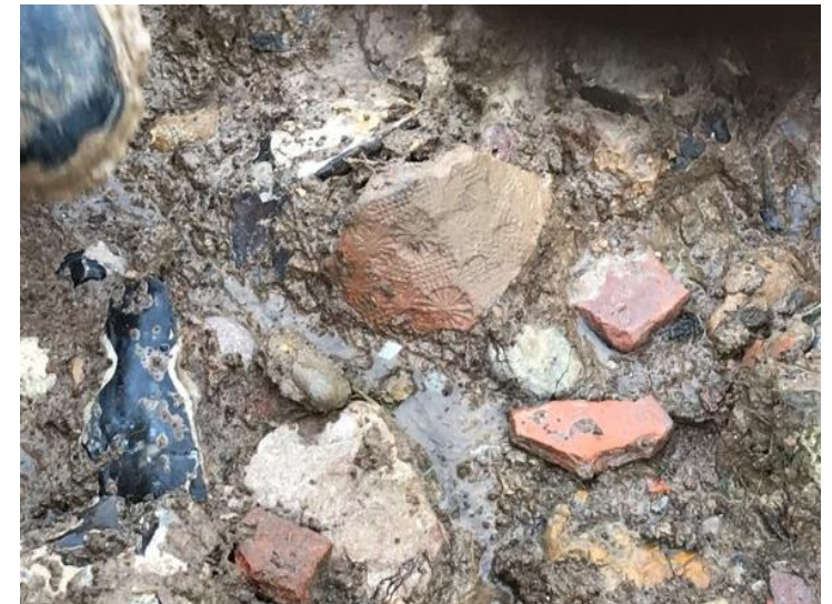
In situ pot sherds with numerous diagnostic sherds