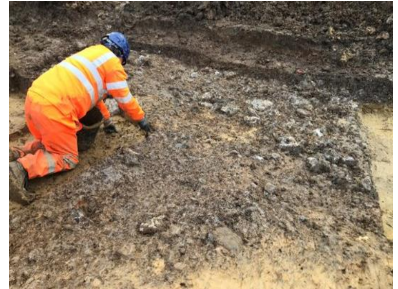
Extensive area of kiln