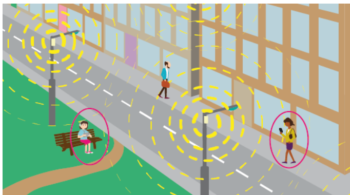
Figure 2: Small cell deployment in a city centre

However, a significant increase in the number of small cells is not expected immediately as operators are concentrating on adding 5G technology to their existing sites.