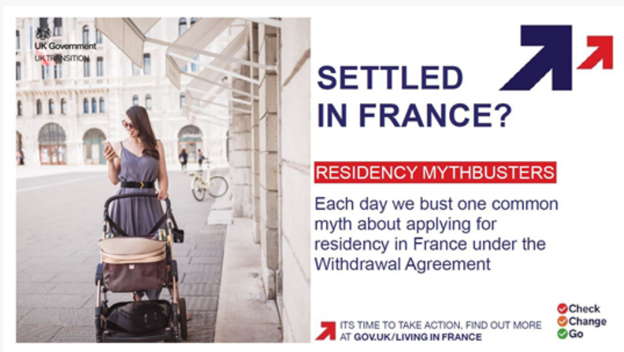
MYTH 4: I do not need to inform the prefecture if my personal situation changes

When it comes to the new Withdrawal Agreement residence permit, some Prefectures have been able to waive this appointment in cases where, for example, individuals have recently given their fingerprints. However, this is not the standard procedure and most people will need to give their fingerprints at a new appointment. If you or your family member is unable for health reasons to attend an appointment at the Prefecture, you should also flag this in the comments section of your application.