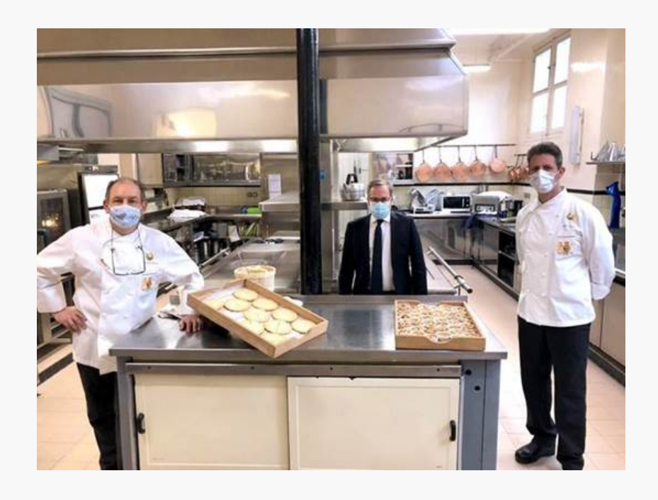
Homemade biscuits to thank staff at the Franco- British Hospital

At the Residence, we made over 80 Christmas puddings to send across France and donated homemade biscuits to thank staff at the Franco- British Hospital. Upheaval has dominated 2020, and some of that will no doubt continue, although the arrival of vaccines offers light at the end of the tunnel. As I write this, the EU Exit negotiations, which will help to shape the UK's relationship with our European neighbours, are still underway. I will update The Connexion readers once we know the outcome.