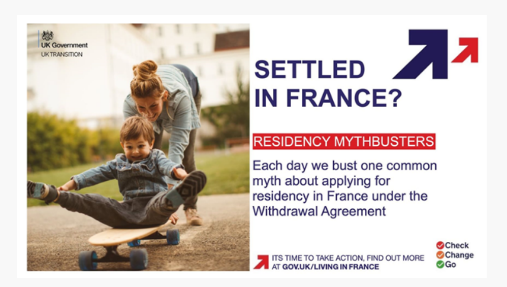
Myth 1: I need to meet high levels of income for residency under the Withdrawal Agreement.

In short: No. Proof of resources is only required in certain limited categories. In most scenarios, you do not need to prove any levels of income or resources. The only case where you do is if you have been in France for less than 5 years, are retired or not working (i.e. self-sufficient); or if you live in France and work in another country. In this case, you need to show you have as much as or more than the minimum level of work welfare benefit, called "revenue solidarite active" (RSA), whatever your age or household composition (currently 564.78 Euros a month). This is confirmed in the recent French legislation, and is a guideline for prefectures to make a judgment call. They will take your full situation into consideration, for example, if you have family in France, or own your property.