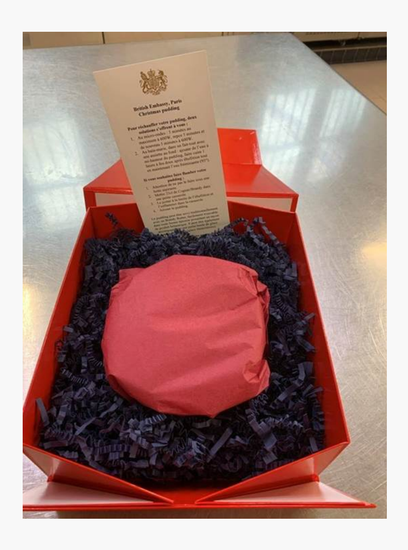
80 Christmas puddings wrapped and ready to send across France

At the Residence, we made over 80 Christmas puddings to send across France and donated homemade biscuits to thank staff at the Franco- British Hospital. Upheaval has dominated 2020, and some of that will no doubt continue, although the arrival of vaccines offers light at the end of the tunnel. As I write this, the EU Exit negotiations, which will help to shape the UK's relationship with our European neighbours, are still underway. I will update The Connexion readers once we know the outcome.