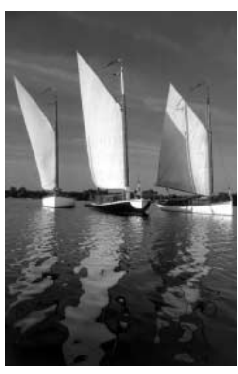
Designed by PaperWhite, London.