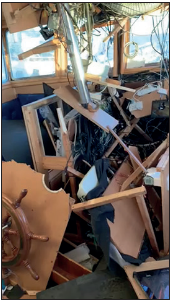
Figure 4: Wheelhouse destruction by shock damage