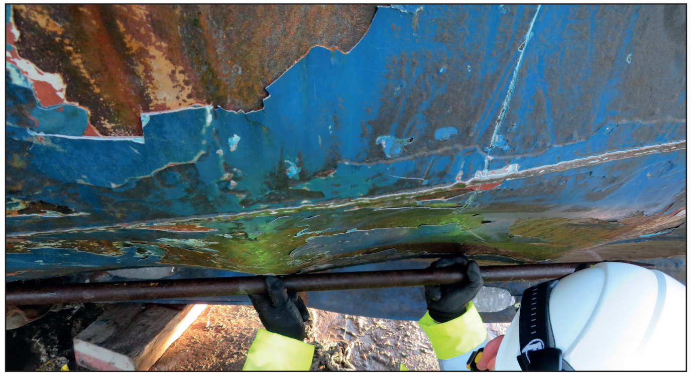
Figure 3: Detail of shell plating damage showing coating loss and indentation between internal frames