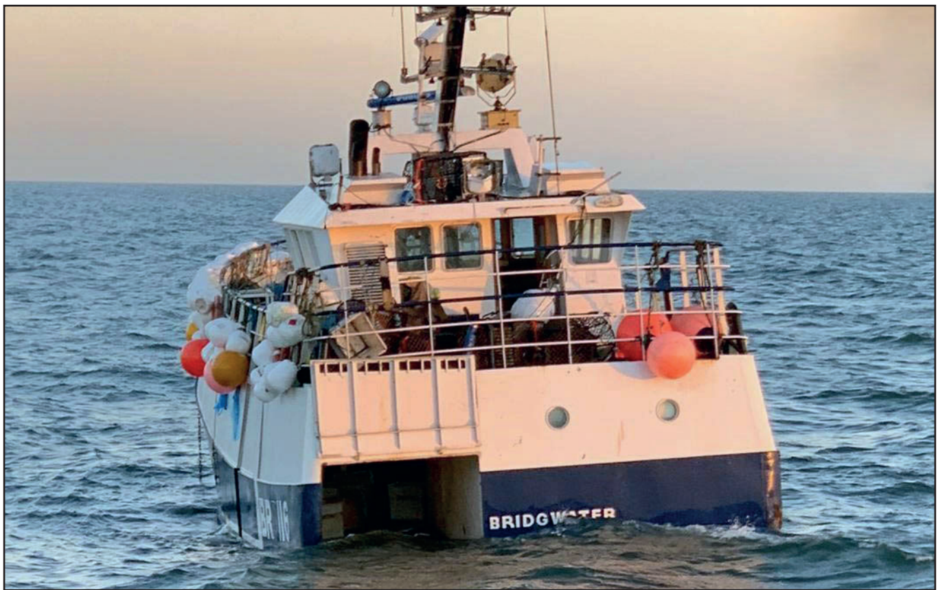
Figure 2: Galwad-Y-Mor, low in the water, after the abandonment

Although the liferaft had been manually activated, all crew members were initially rescued by the offshore support vessel, Esvagt Njord , then transferred ashore to hospital by helicopter and lifeboat. The abandoned Galwad-Y-Mor , which had settled low in the water (Figure 2) , was towed to Grimsby by the tug, GPS Avenger , then lifted out of the water.