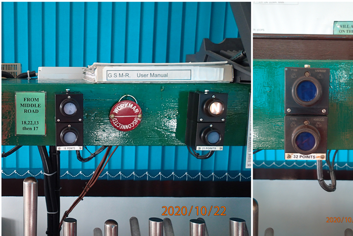
Indicators for 18, 21 and 32 points as observed after the accident. The indicators for 18 points (left) and 32 points (right) are blank, showing no detection of these points, whereas that for 21 points (middle) is lit with 'N' for normal position.

The signaller was not aware of the problem with the points because he had been relying on the position of levers in the signal box that are used to control the points, rather than checking that the points indicators were illuminated. An informal, locally-produced reference sheet in the signal box described all the lever movements that were necessary for a given train movement, and the signaller repeatedly consulted this sheet to check that he had carried out the correct actions. Because all the levers were in the correct positions according to the sheet, the signaller believed that the routes for each train were correctly set. However, the signaller did not recognise that, because the points at Bognor Regis involved in this accident are motorised, the position of the point levers only served as a reminder that he had commanded the points to move. The lever position does not necessarily reflect the actual position of the points on the ground, as it would if a mechanical linkage was in place and working correctly.