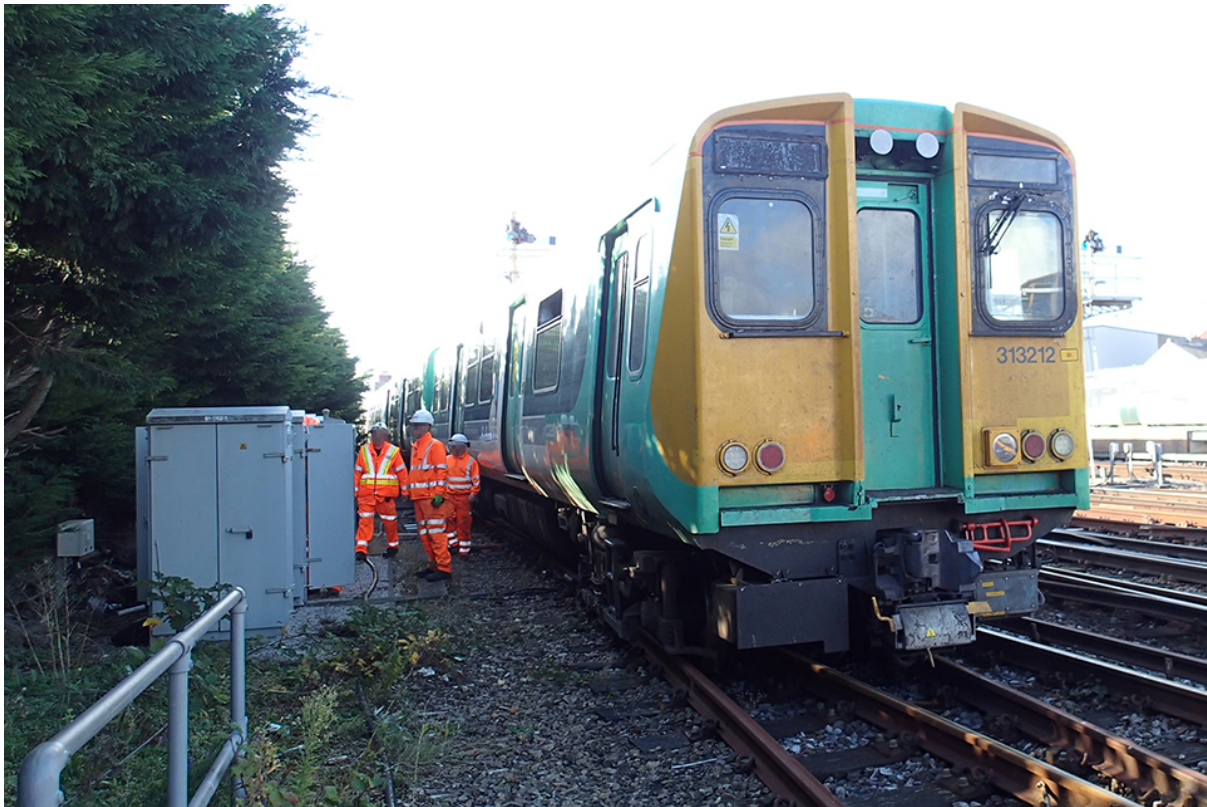
The derailed leading end of the train

The train, a three-car class 313 electric multiple unit, was travelling at approximately 5 mph (8 km/h) at the time of the accident. All four wheels of its leading bogie derailed on points, numbered 32B, a short distance beyond signal BR12, which is the platform 4 starting signal.