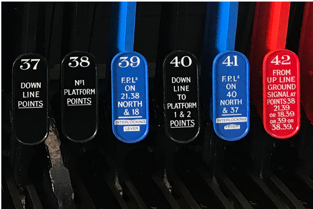
Example of the labelling on the blue facing point lock levers in Bognor Regis signal box.