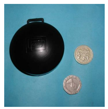
Figure 2 A Dstl ADS radon detector

22. The RPA should be consulted on the arrangements that should be in place for the monitoring of radon in wholly underground workplaces such as mines, tunnels and caves and in workplaces where other sources of radon such as radium-luminised dials are kept, for example museums and heritage centres.