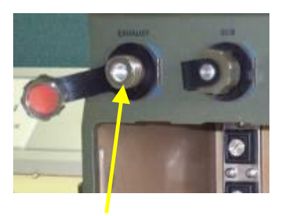
Wipe the MCAD exhaust port

f. in addition, a supplementary leak test of the air inlet manifold of the MCAD should be undertaken to coincide with sieve pack replacement. One dry sample should be taken.