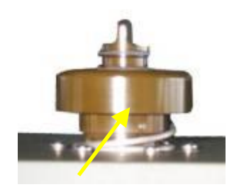
Wipe the inlet port under the rain cap assembly