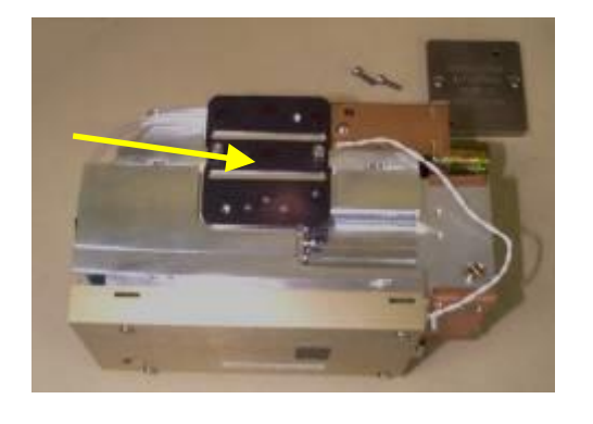
Wipe the area around the sieve