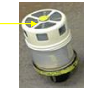
F31 Smoke Detector