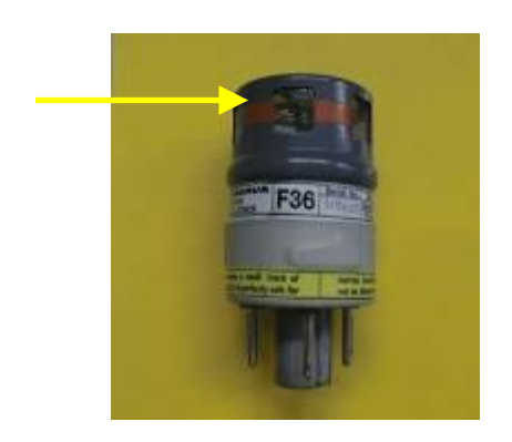
F36 Smoke Detector