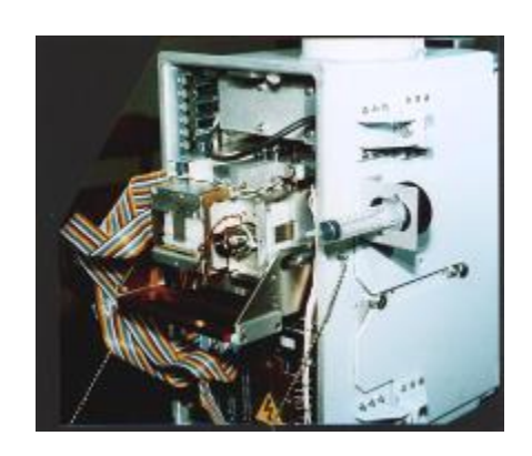
The sieve pack unit should be pulled forward. pack.