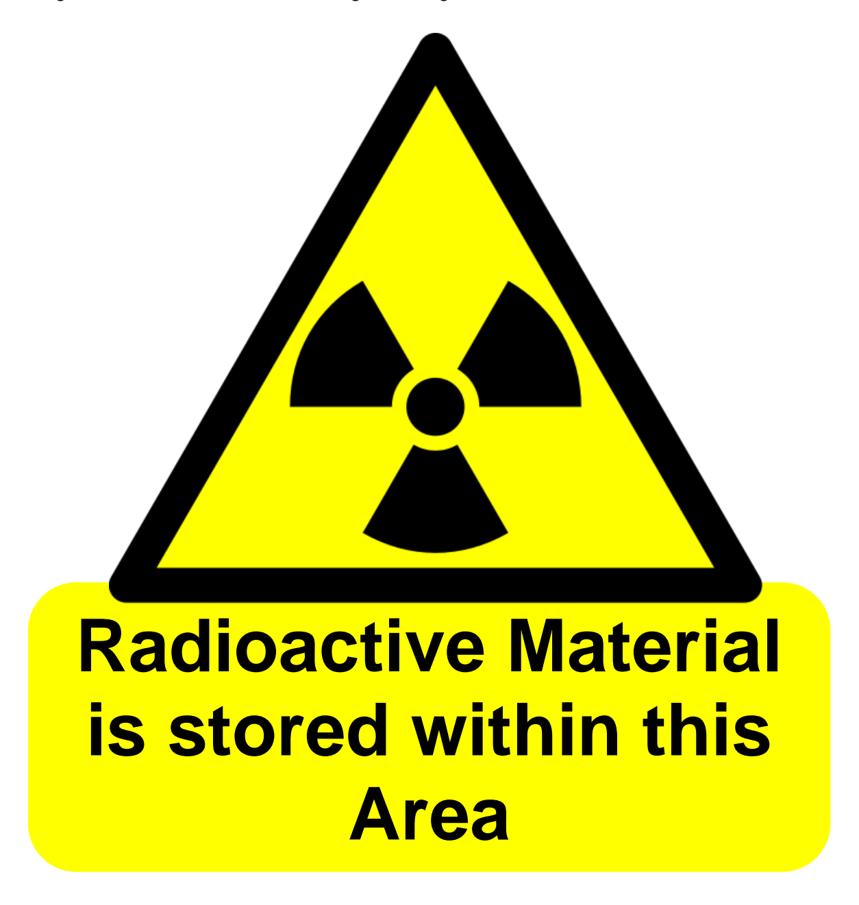
Figure 2 Radioactive material storage area sign