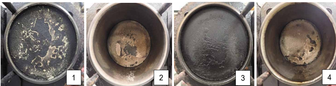
Figure 10 Piston crowns

The online version of this report was corrected on 19 November 2020.