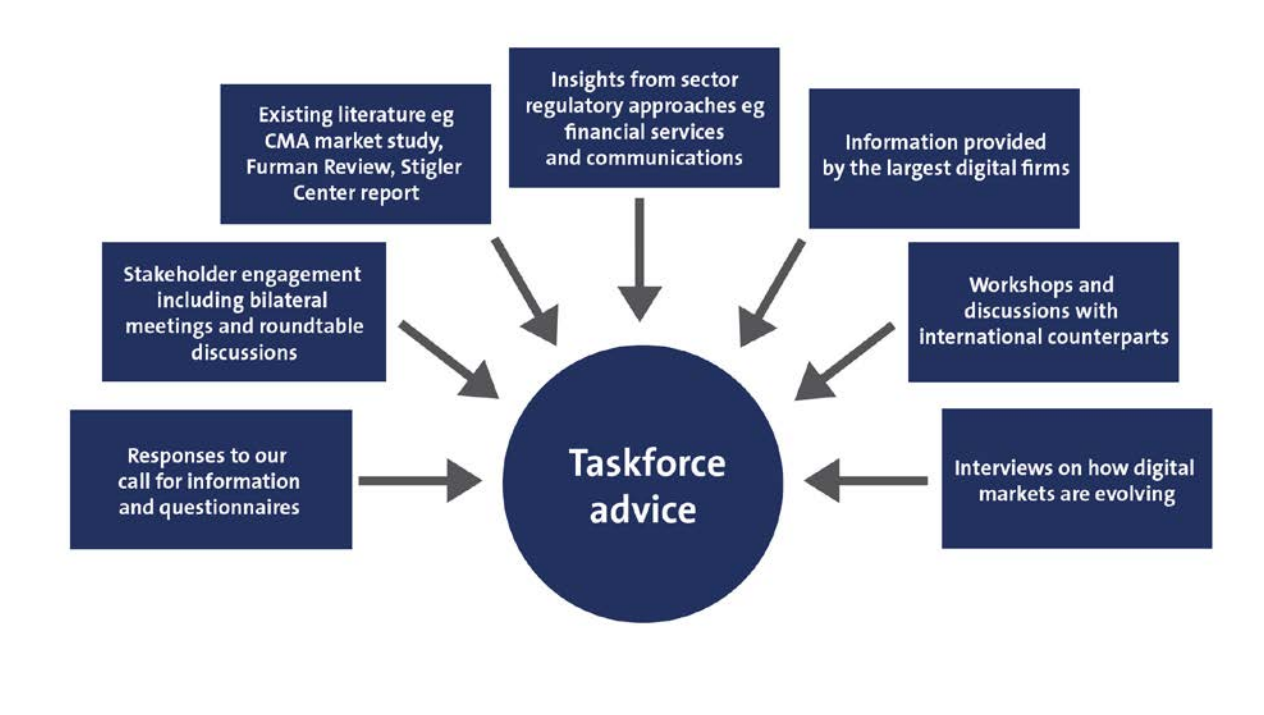
Figure 1.1: summary of the key sources informing our advice