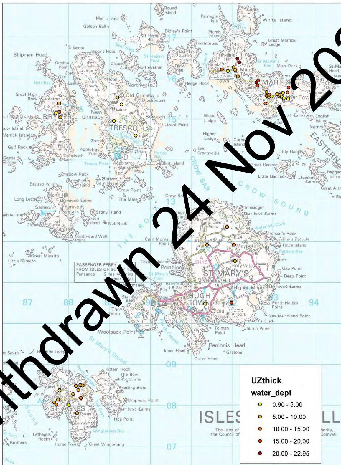
Figure 35: Unsaturated zone thicknesses (m) measured Nov 2015 - Jan 2016