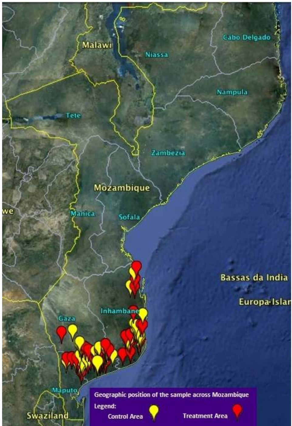
Figure 2: Experimental locations