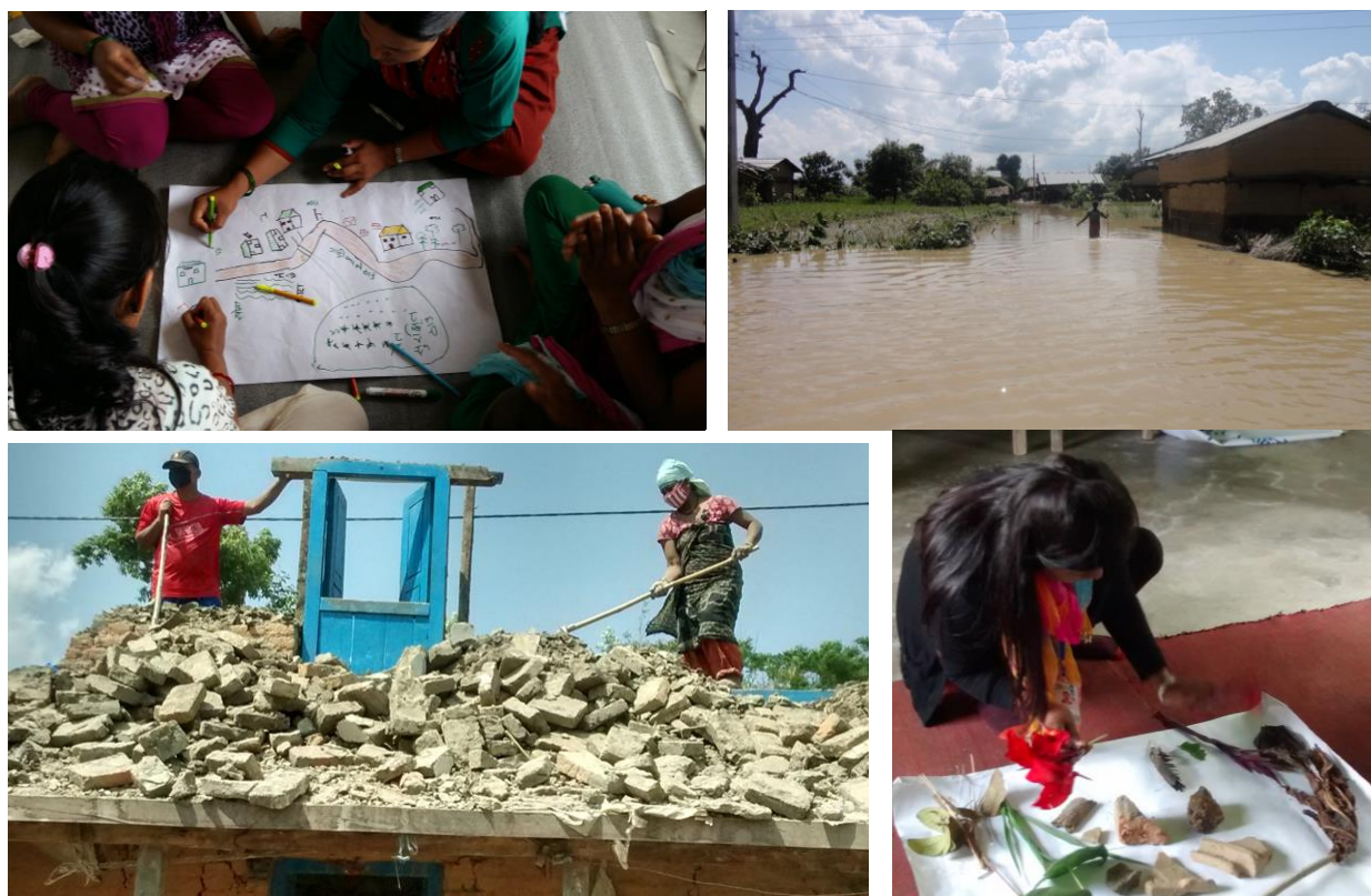
Photos from top left moving clockwise: community mapping during intervention; Kailali district flooding; Bhaktapur district earthquake damage; using natural materials during intervention.