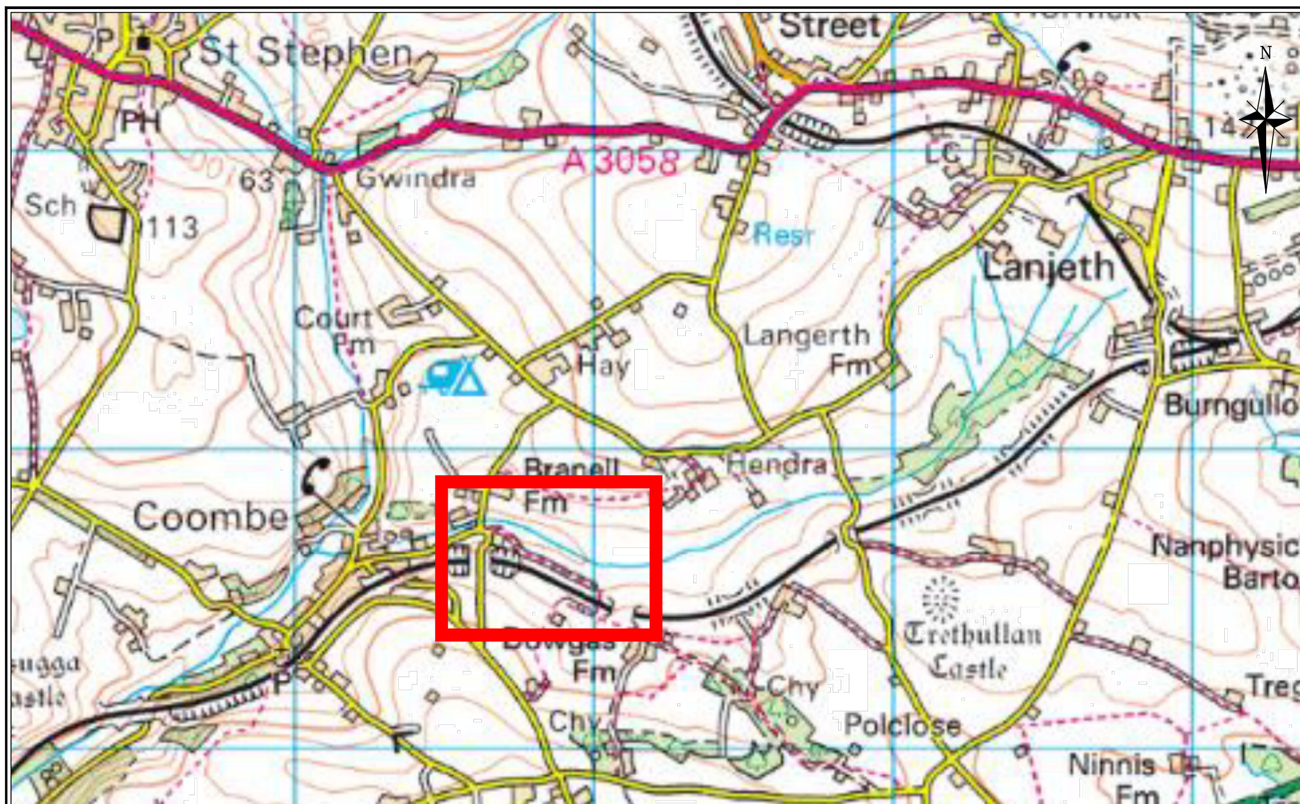
SITE LOCATION (SCALE 1:12500)