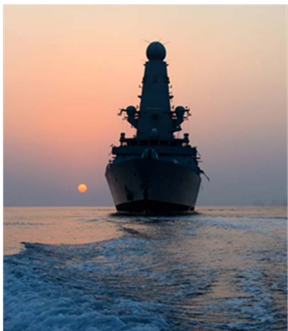
Figure 3: Type 45 destroyer HMS Dragon pictured in the Middle East during Op KIPION 2013

Due to the numbers of RFA 4 personnel deployed on Op KIPION, a table has been included presenting the number of UK entitled civilian casualties by financial year.