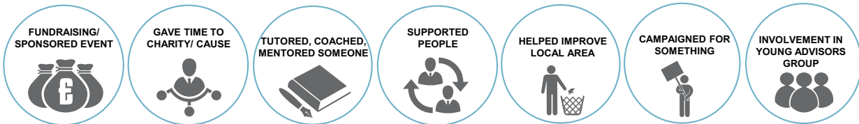
Figure 1.1: Social action activities 6

Young people are also asked if they had donated money or goods within the past 12 months. Although this activity is not classified as social action under the #iwill definition, this is included to ensure that respondents do not miscode donations under other categories, such as fundraising. These responses are not categorised as social action in the report.