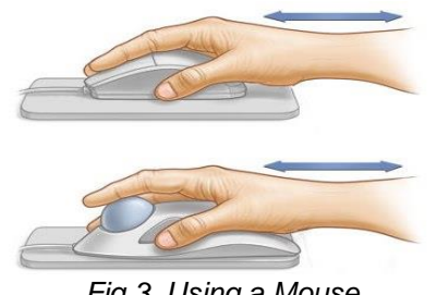
Fig 3. Using a Mouse

sit upright and sit in close to the desk. e.