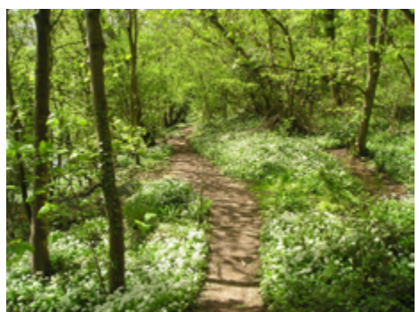
Re-surfacing work in Darlington Borough on the Teesdale Way

and interpret the area's heritage, and provide opportunities for people to get actively involved.