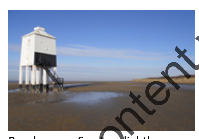
Burnham-on-Sea Low lighthouse

In Doniford, as part of the new route, a 15-metre footbridge has been built over the river Swill. For the first time, this provides an easy-access walking route between the two sides of the village, allowing those staying at several nearby caravan sites to walk safely to Doniford Farm shop and café, the hearby halt for the West Somerset Railway or onwards down the coast. It is also the first time such a major piece of infrastructure has been built for the England Coast Path.