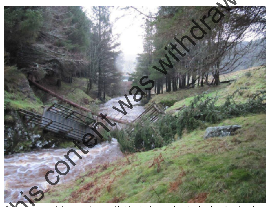
Access interupted due to a damaged bridge in the Northumberland National Park

The cost of repair of this winter's destruction is estimated to be almost half a million pounds, far exceeding budgets the Council and the National Park set aside for dealing with their existing (and long) list of paths needing maintenance. The loss of local amenity is bad enough but the economies of these northern rural counties depend on tourism, and access to the countryside is, fundamentally, why the tourists come.