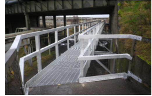
Wilton Steel Works - new Tata Steel Bridge on Teesdale Way in Redcar and Cleveland

Two major projects have been completed within Redcar and Cleveland Borough; the steel footbridge at the Wilton Steel Works (costing £100K) crossing the main east coast railway line safely, and could not have been achieved without considerable financial assistance from the Coastal Communities Fund and Tata Steel. This is an example