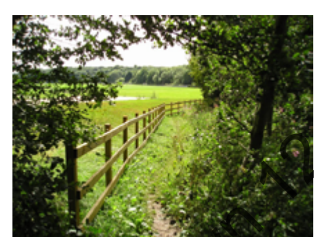
Middlesbrough FC training ground

The River Tees Rediscovered programme runs over 5 years. A diverse range of projects is being delivered, including schemes which will conserve and enhance natural environment and heritage features, improve public access to nature and heritage, celebrate