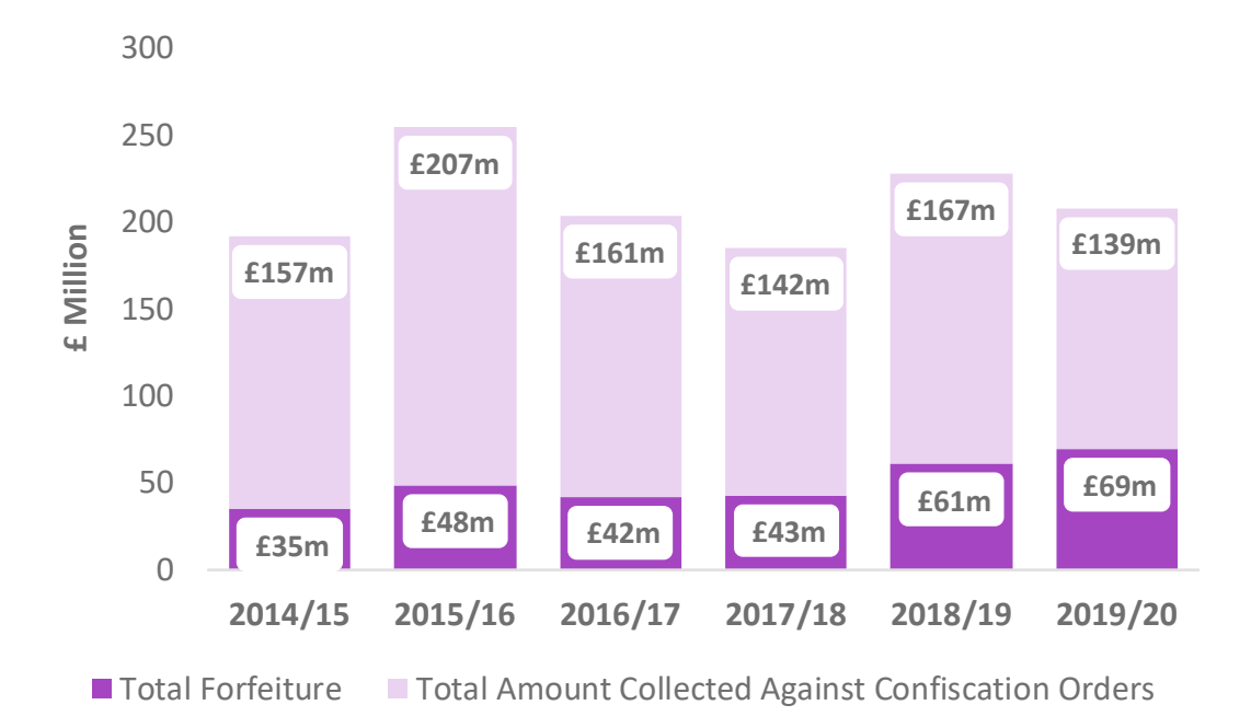
Figure 1: Amount of money collected from confiscation orders and forfeiture from 2014/15 to 2019/20