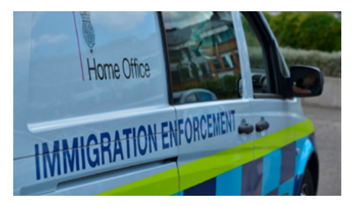
Immigration Enforcement Van

The first, 'An inspection of the Home Office's Reporting and Offender Management processes