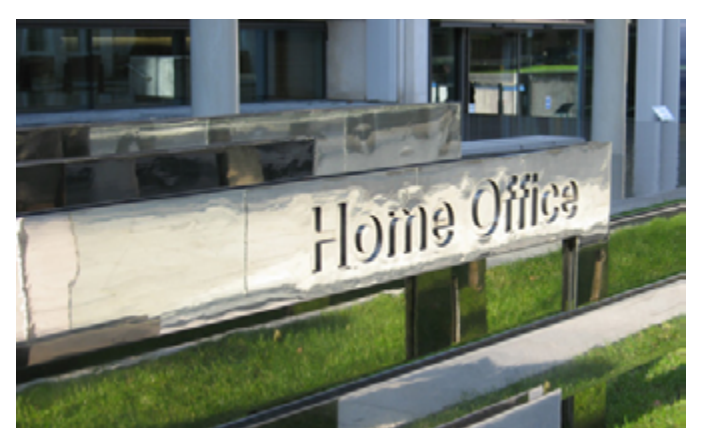
Home Office HQ, 2 Marsham Street, City of Westminster

While it is important to maintain a good working relationship with officials, I argued that when the Inspectorate was created the intention was that the Chief Inspector would provide the Home Secretary with insights and advice independently of the department, whereas, in practice, my reports are filtered through officials. In her response, the Home Secretary recognised the importance of direct contact with ministers, as well as a close relationship with officials, and since the start of 2020 I have met and corresponded with both Immigration Ministers.<sup>8</sup> Now that my appointment has been extended to