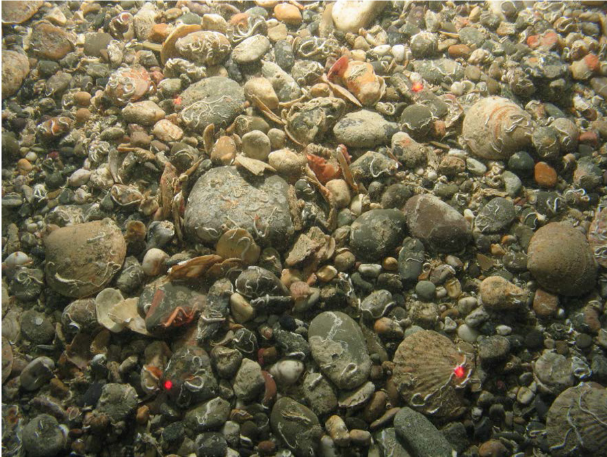
Subtidal coarse sediment