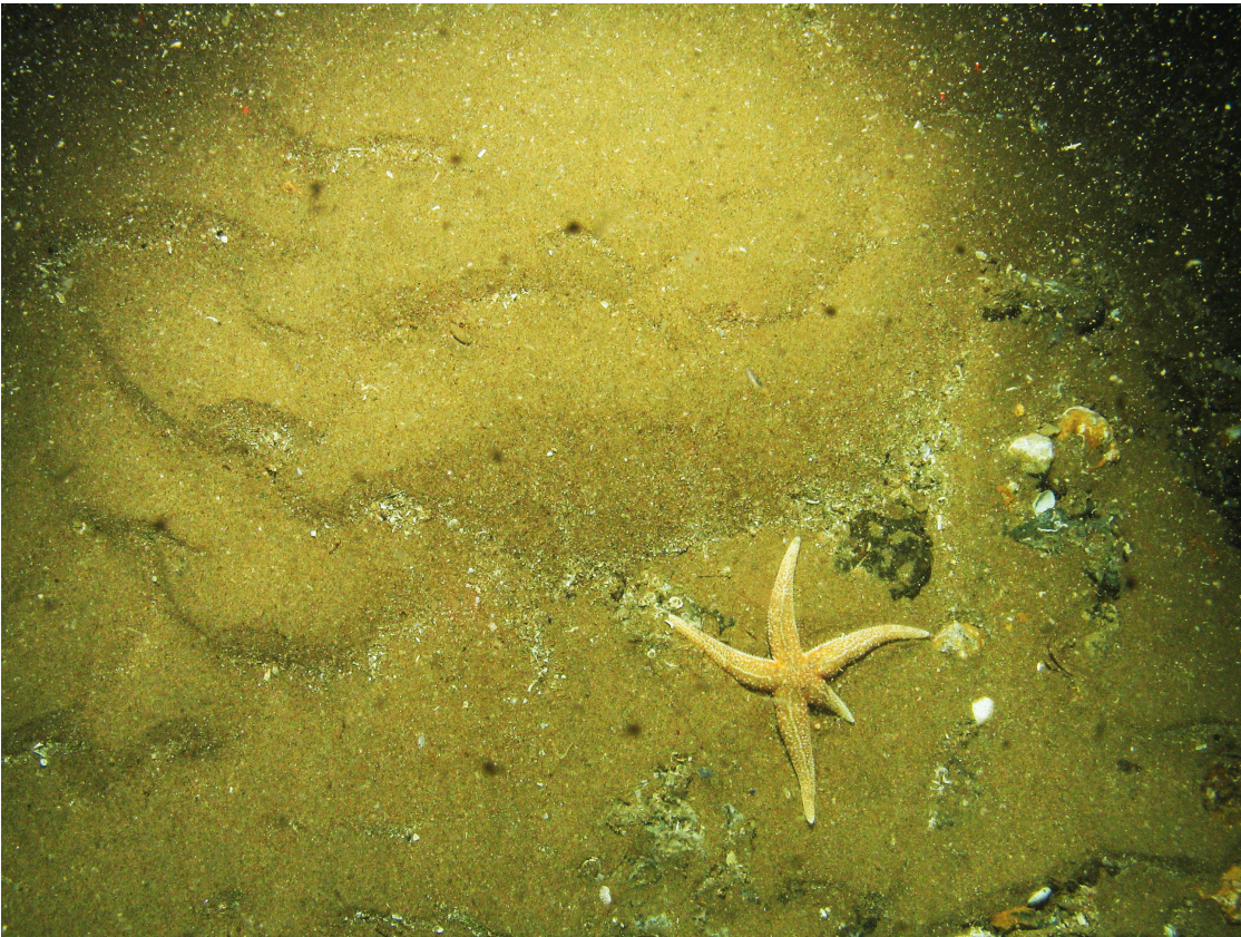
Subtidal sand and Amphiura filiformis brittlestar arms