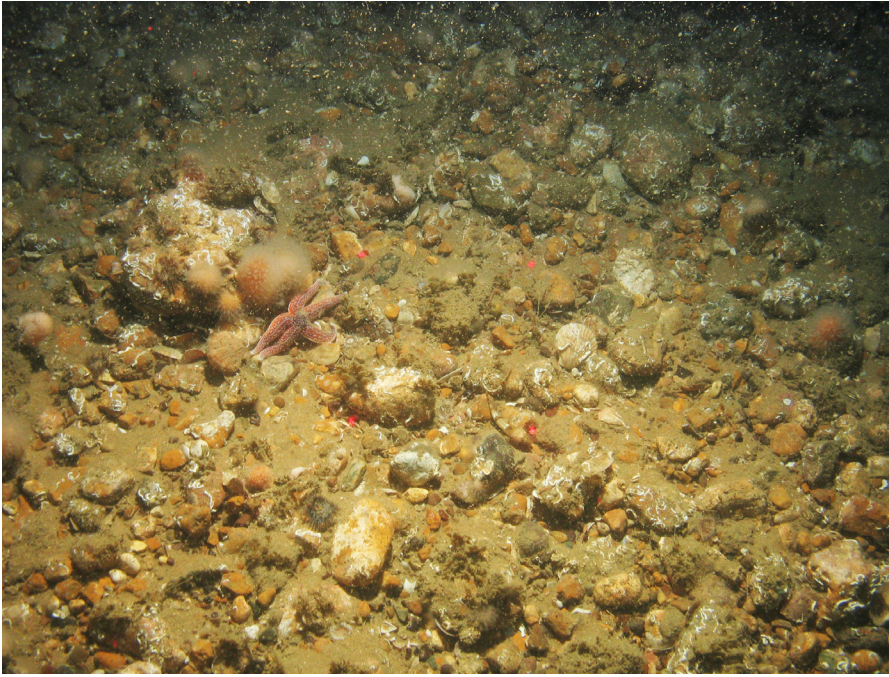
Subtidal coarse sediment