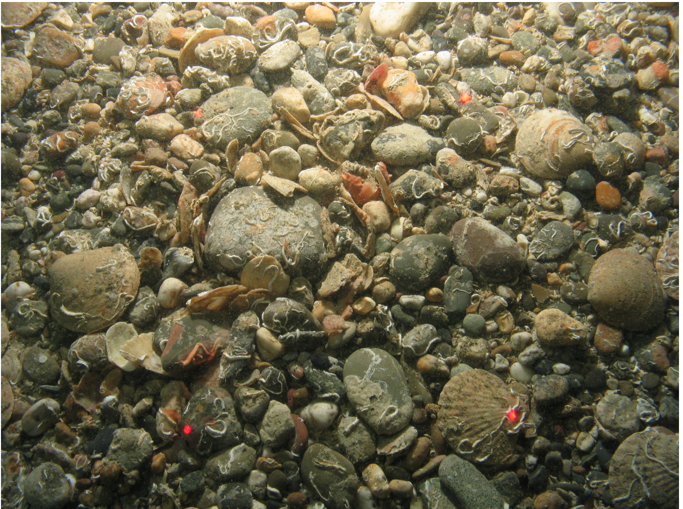
Subtidal coarse sediment