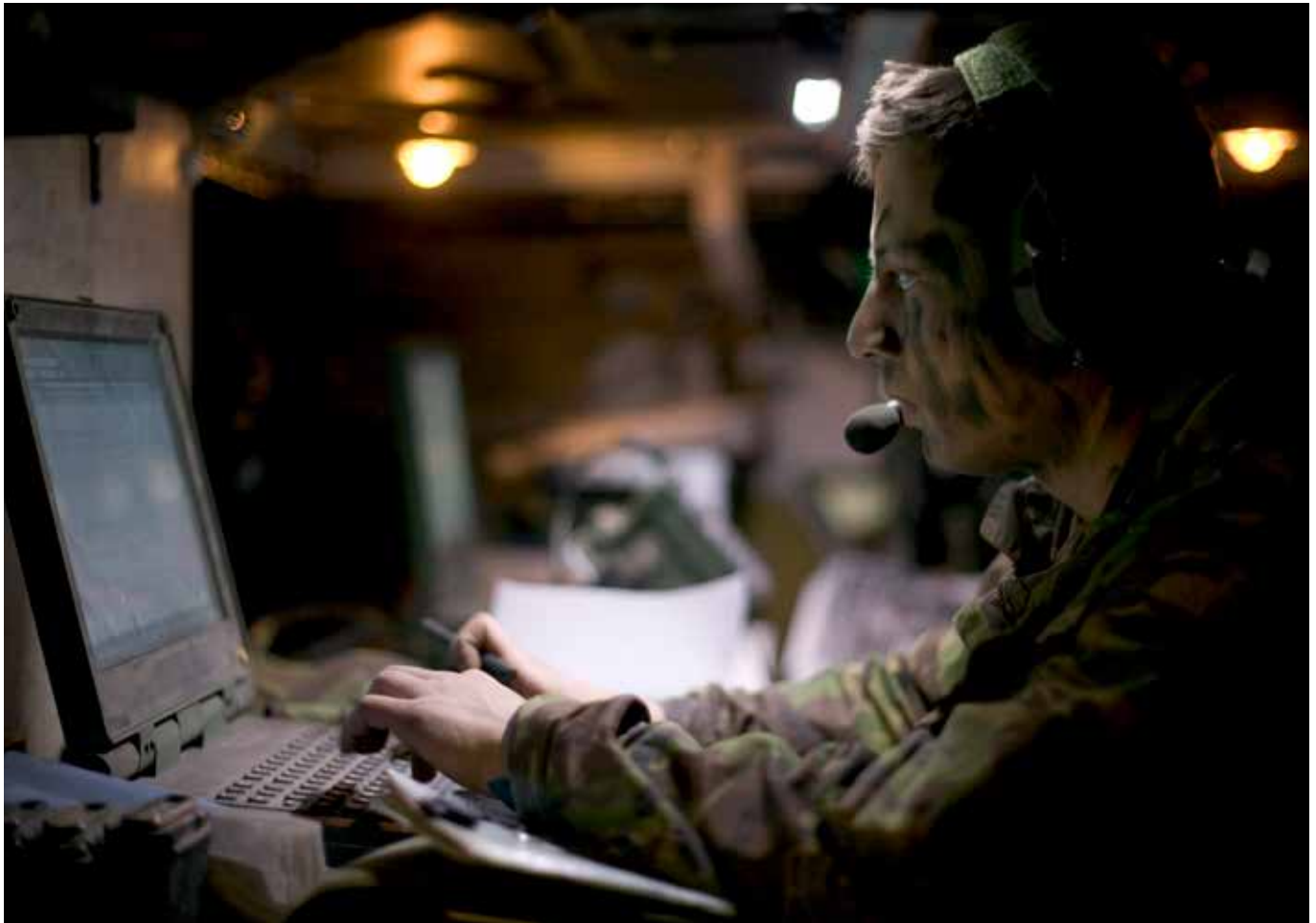
Pictured: The Defence Targeting Toolset has been delivered to the British Army

A team at DE&S has delivered a world-leading capability that allows the British Army to coordinate Land and Air strikes against enemy targets more effectively.