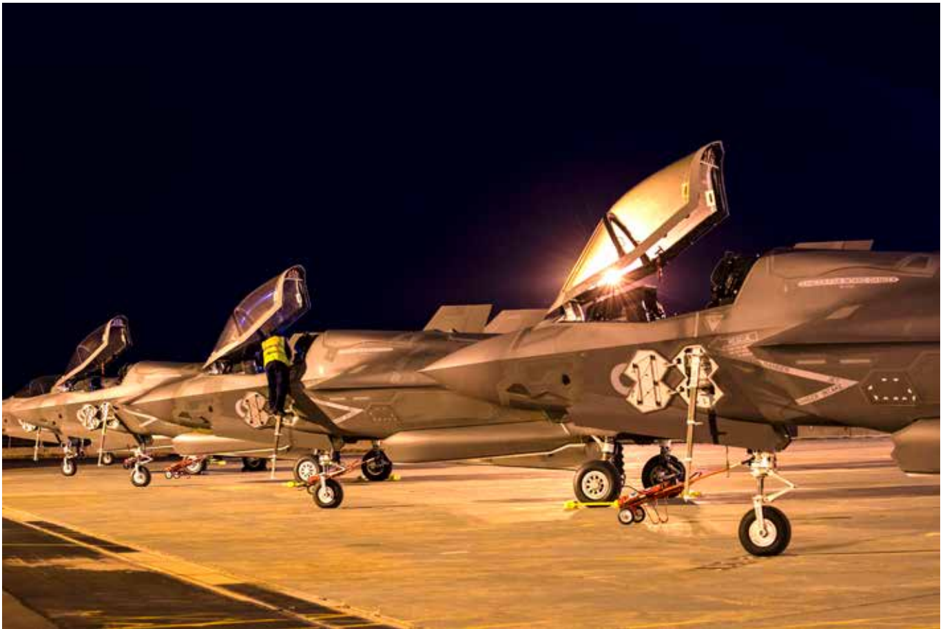
Pictured: A further five F-35B Lightning jets have arrived at RAF Marham

The next tranche of F-35B Lightning aircraft has landed at RAF Marham following a 3,000-mile ferry flight across the Atlantic supported by RAF Voyager tankers.