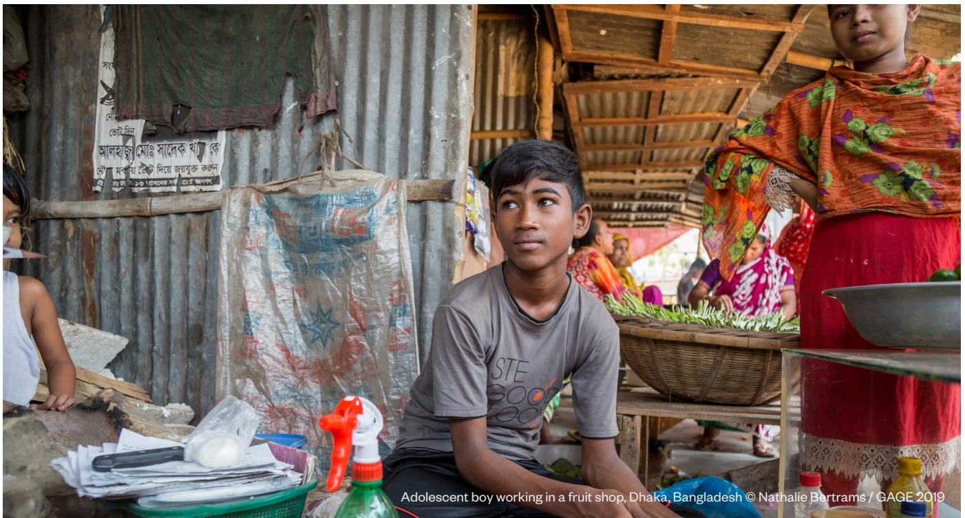
Adolescent boy working in a fruit shop, Dhaka, Bangladesh