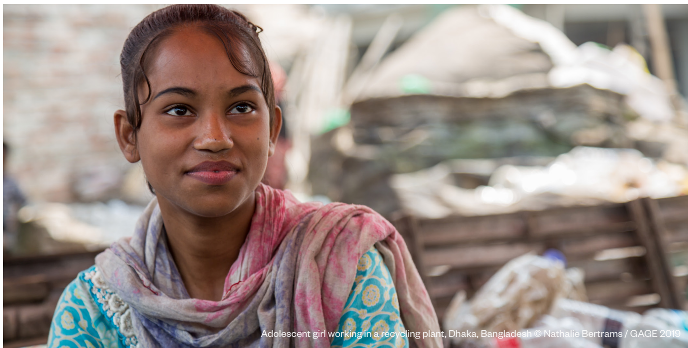
Adolescent girl working in a recycling plant, Dhaka, Bangladesh