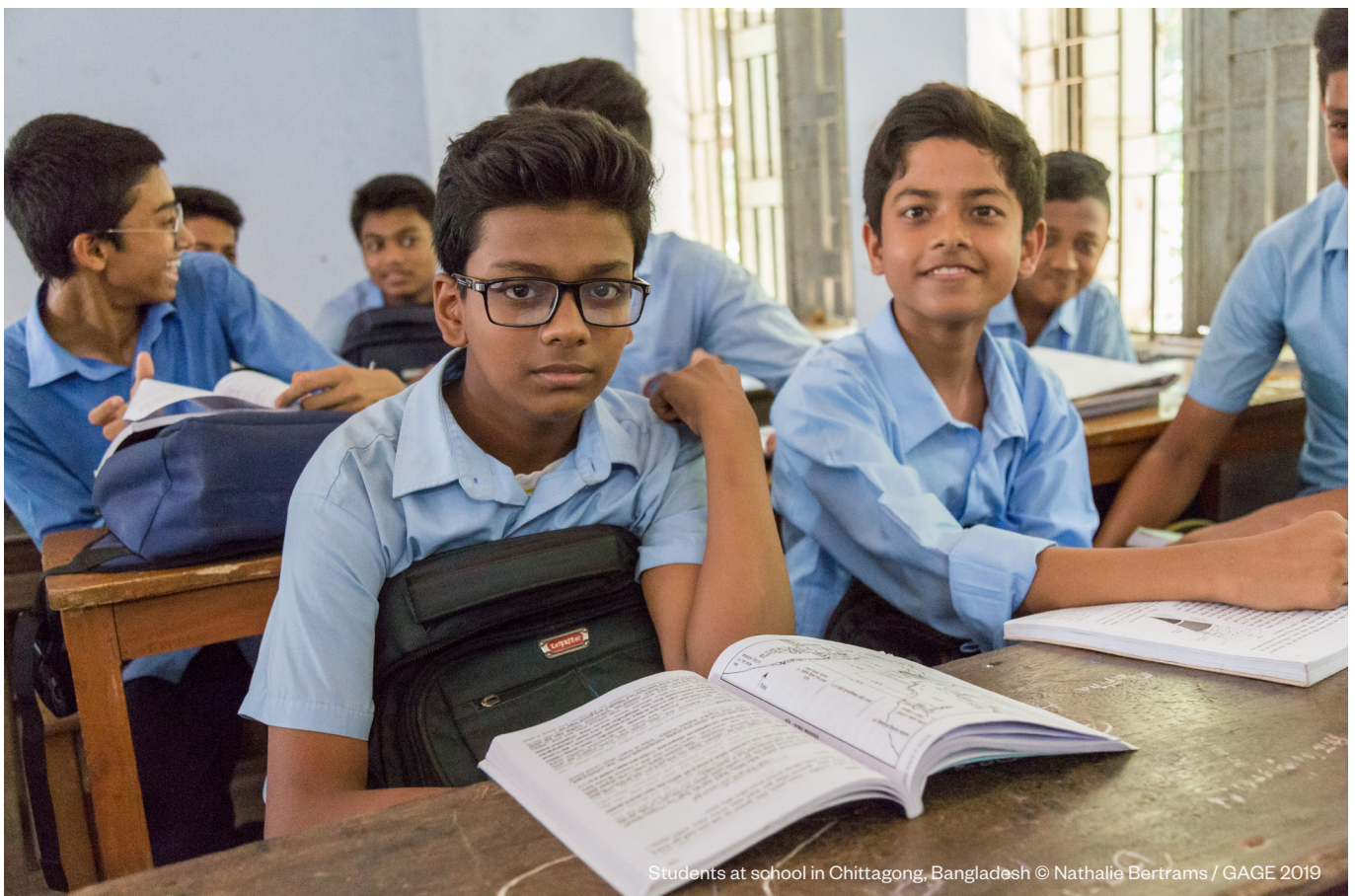
Students at school in Chittagong, Bangladesh

Sometimes, parents transfer their children to a madrasa , either because they want them to pursue a religious career or because such education is usually free and includes food, board and books. The quality of madrasas is variable, however, and has been highlighted as concerning by a number of studies (according to BANBIES, 2015, Chittagong has the second highest proportion of madrasa schools in Bangladesh, at 17.75%). While our survey does not provide a great deal of evidence as to quality, our analyses in Chittagong suggest that caregivers who send their children to madrasas tend to have lower aspirations for them, and children are likely to be brought up in more traditional environments (e.g. with higher levels of physical punishment) and have fewer resources at school and at home. Our data suggests that many madrasa students' parents are more focused on their learning the Quran, the Hadith and religious books than excelling in exams. According to the head of the Community A madrasa , one rationale parents and madrasa teachers have for sending