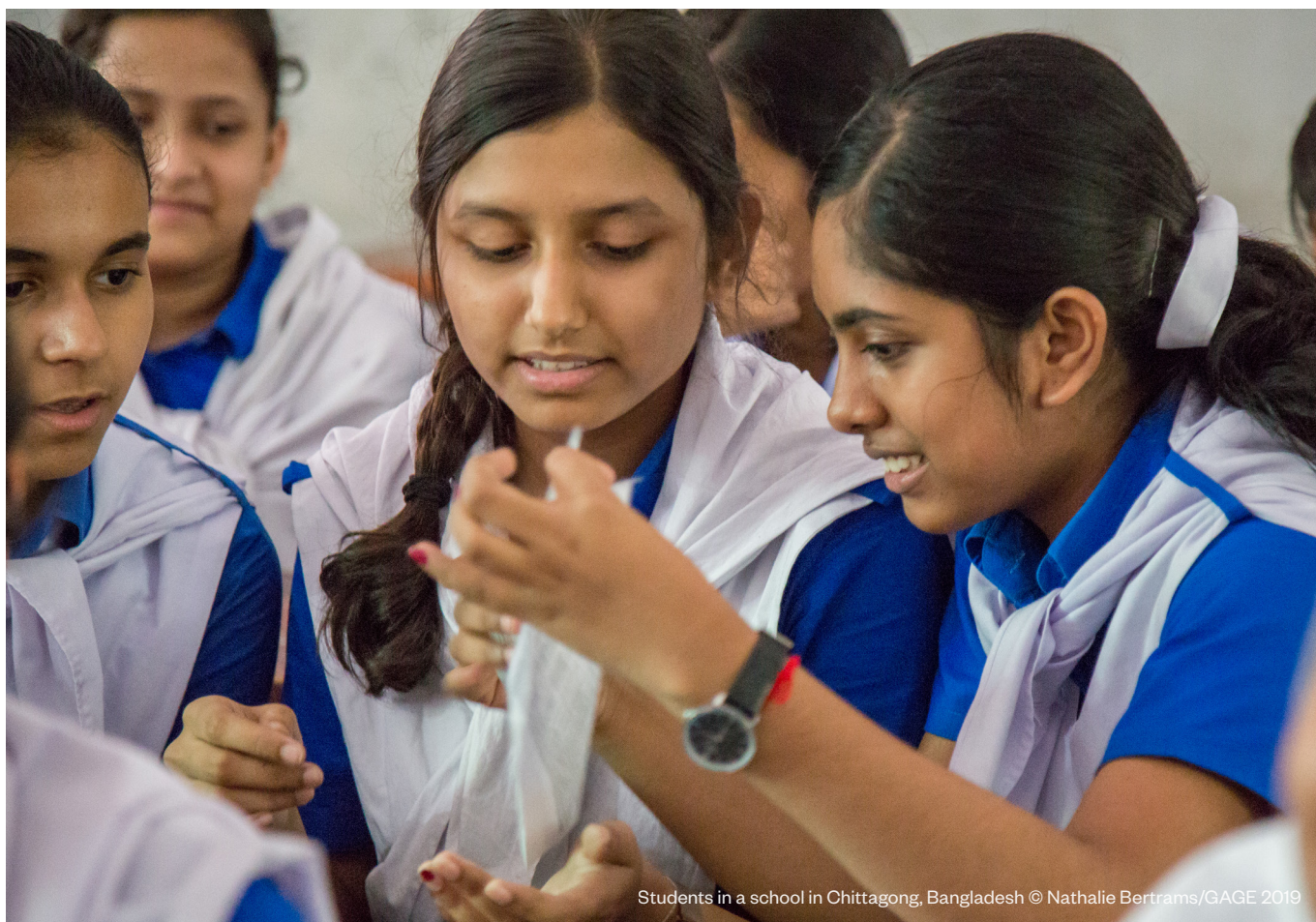
Students in a school in Chittagong, Bangladesh

In interviews, men in Community C commented on the changes in the academic curriculum, which now includes information and communication technology (ICT) and