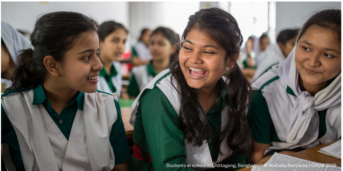
Students at school in Chittagong, Bangladesh