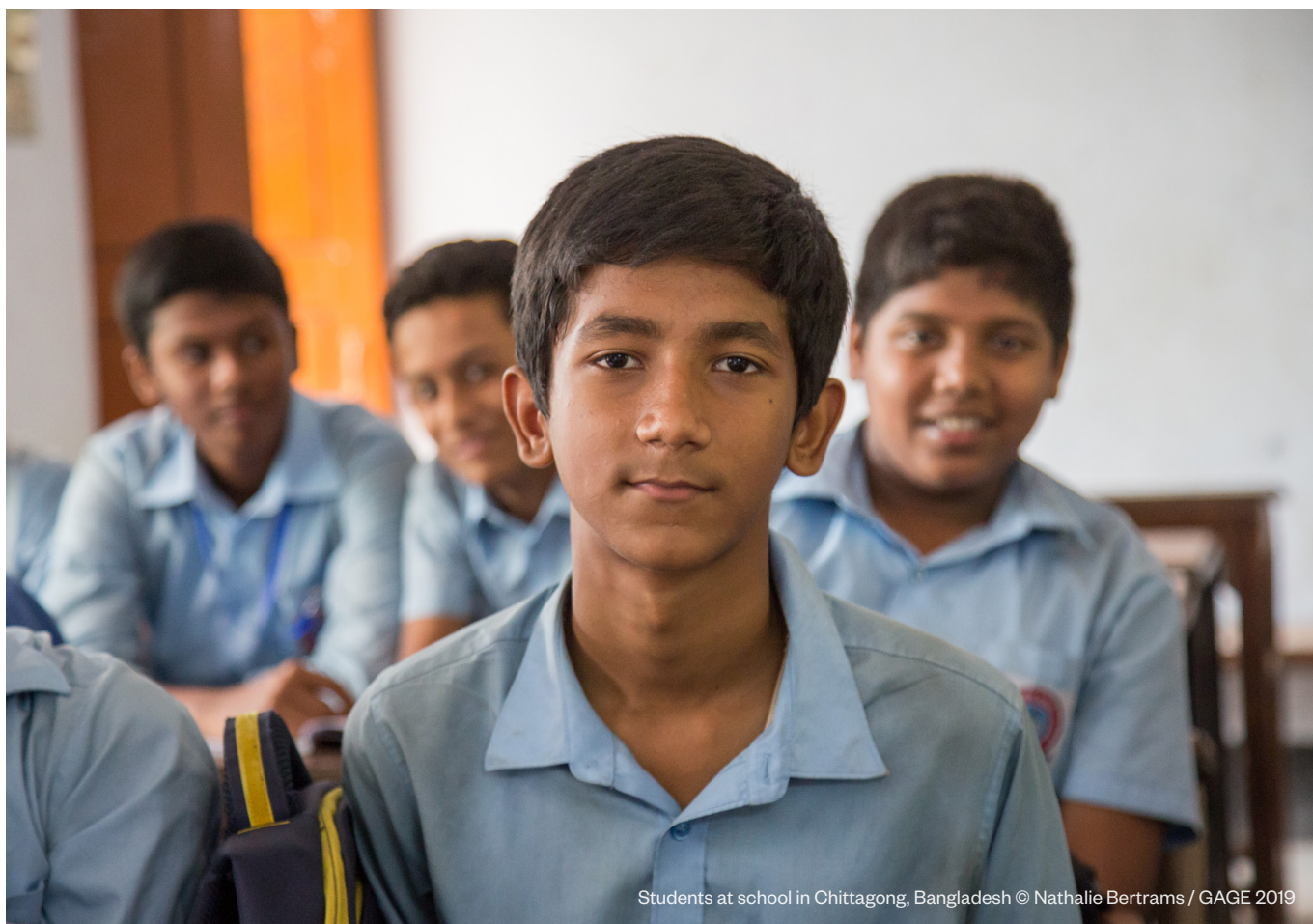
Students at school in Chittagong, Bangladesh

Generally, it is tough to communicate with the children who are deaf and dumb; there are no teachers for doing that. There should be special teachers for them. Because, if I admit a dumb boy, I will not understand his language. So, a skilled teacher is a must who can understand and communicate with those children. The government can set up special school for them. As Chittagong is a big city, it has to have some facilities. Because, if there is a blind or deaf student, they can still communicate, but the dumb can't..'