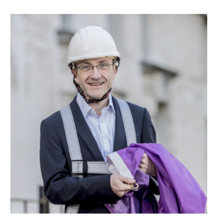
MOD Civilian Disability Champion promoting International Day of Persons with Disabilities.

Key TLB and ALB Levels of Ambition, actions and milestones will be included within the Defence People Plan; Defence Plan and individual Command and Corporate Plans. They will also be collated into a single high-level D&I plan, together with any pan-Defence initiatives being managed centrally, Progress against this will be monitored collectively by a D&I Board (see below).