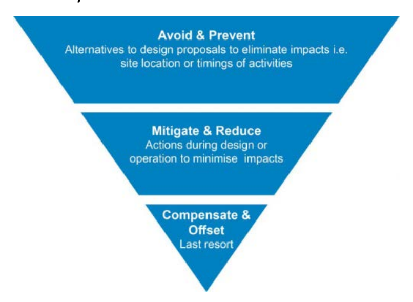
Figure 2: Mitigation hierarchy