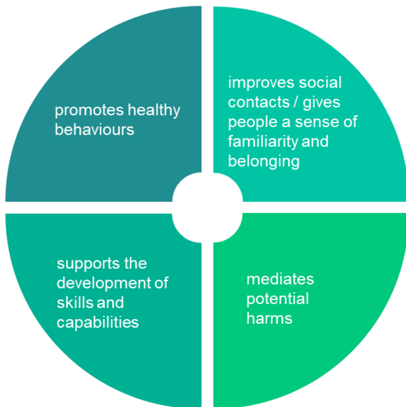
Figure 1: Ways in which greenspace may be linked to positive health outcomes

For all these reasons, improving access to quality greenspace has the potential to improve health outcomes for the whole population. However this is particularly true for disadvantaged communities, who appear to accrue an even greater health benefit from living in a greener environment (5). This means that greenspace also can be an important tool in the ambition to increase healthy life expectancy and narrow the gap between the life chances of the richest and poorest in society (6).