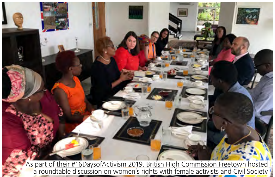
As part of their #16DaysofActivism 2019, British High Commission Freetown hosted a roundtable discussion on women's rights with female activists and Civil Society

Following the successful 2018 PSVI Film Festival, we funded capacity building for young filmmakers in Goma