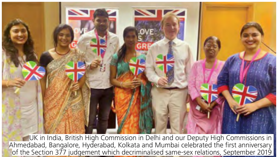
UK in India, British High Commission in Delhi and our Deputy High Commissions in Ahmedabad, Bangalore, Hyderabad, Kolkata and Mumbai celebrated the first anniversary of the Section 377 judgement which decriminalised same-sex relations, September 2019

With a core objective to increase respect for equality and non-