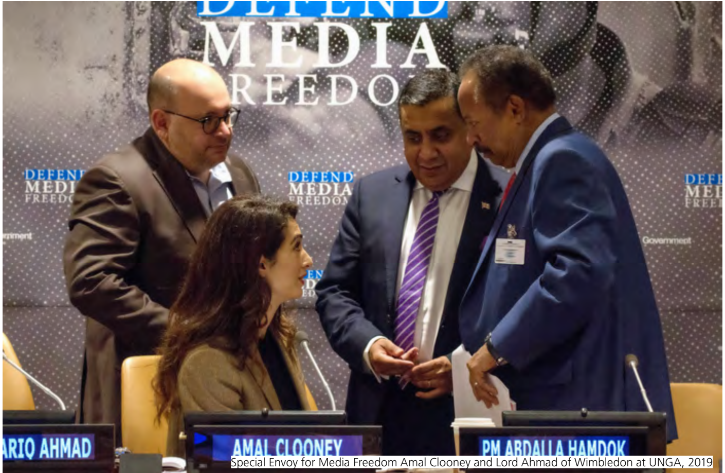
Special Envoy for Media Freedom Amal Clooney and Lord Ahmad of Wimbledon at UNGA, 2019

Other events and conferences were held throughout the year focussing on challenges and developments in specific regions and countries. The UK made statements in multilateral fora, including the Human Rights Council, OSCE, Council of Europe, and the Commonwealth, encouraging partners to do more to translate collective commitments into tangible action. UK Ministers, Ambassadors and High Commissioners, and diplomatic missions lobbied privately and publicly on specific individual cases and situations of concern.