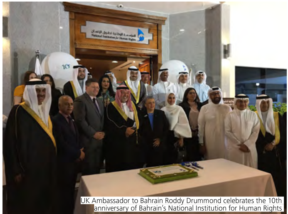
UK Ambassador to Bahrain Roddy Drummond celebrates the 10th anniversary of Bahrain's National Institution for Human Rights

Bahrain dropped one place in the World Press Freedom Index, to 167