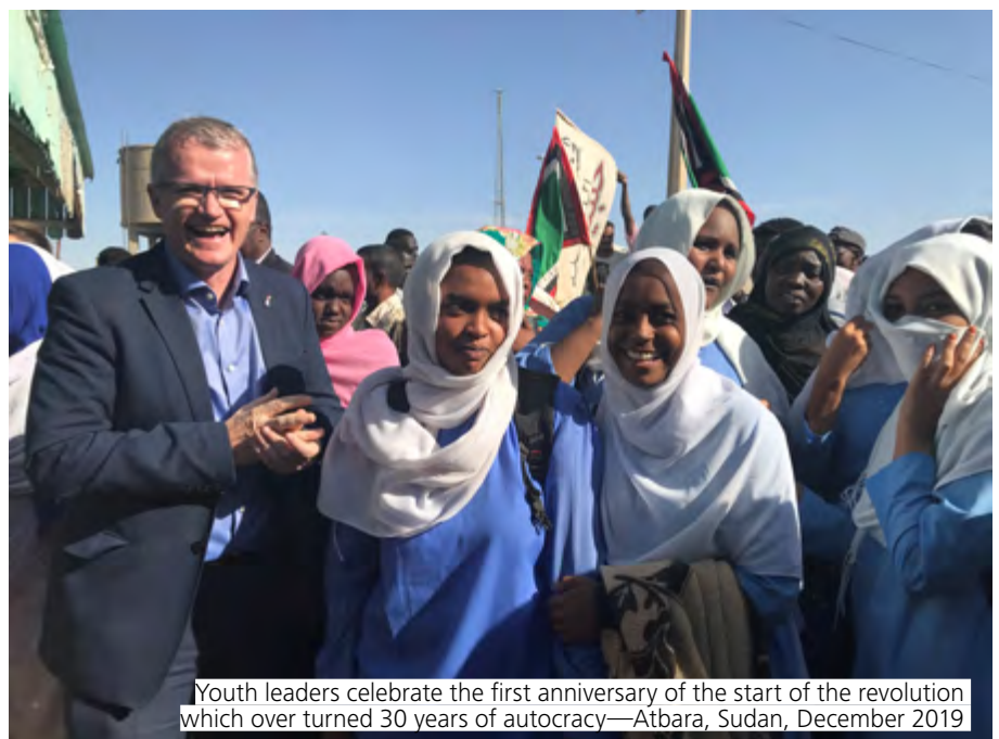
Youth leaders celebrate the first anniversary of the start of the revolution which over turned 30 years of autocracy—Atbara, Sudan, December 2019

2019 was a year of significant change in Sudan. A mass protest movement led to the end of President Bashir's 30-year rule and to the establishment of a civilian-led transitional government, whose objective was to pave the way for democracy. The human rights situation was mixed. Serious human rights violations accompanied the