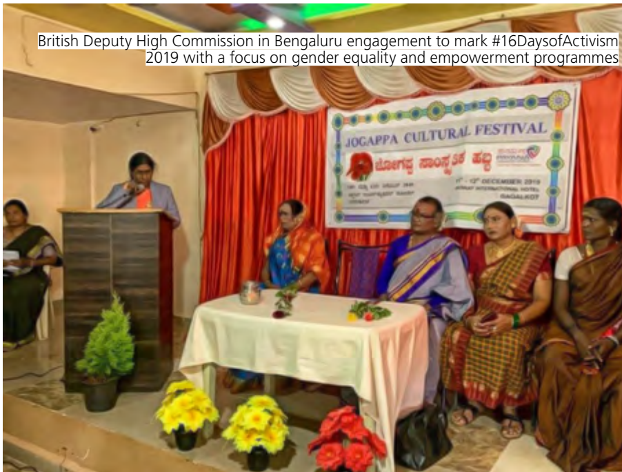
British Deputy High Commission in Bengaluru engagement to mark #16DaysOfActivism 2019 with a focus on gender equality and empowerment programmes

Equality, the UK continues to lead and invest in girls' education, sexual and reproductive health and rights (SRHR), women's political and economic empowerment, and ending violence against women and girls. The FCO, DFID, Conflict, Stability and Security Fund (CSSF), and the Stabilisation Unit have developed a suite of guidance and training products to mainstream gender equality across the UK government's work.