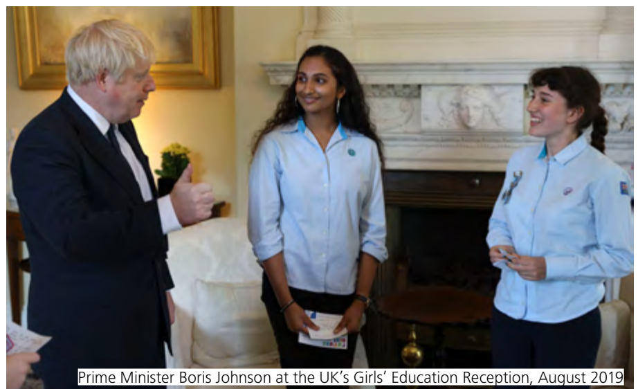
Prime Minister Boris Johnson at the UK's Girls' Education Reception, August 2019