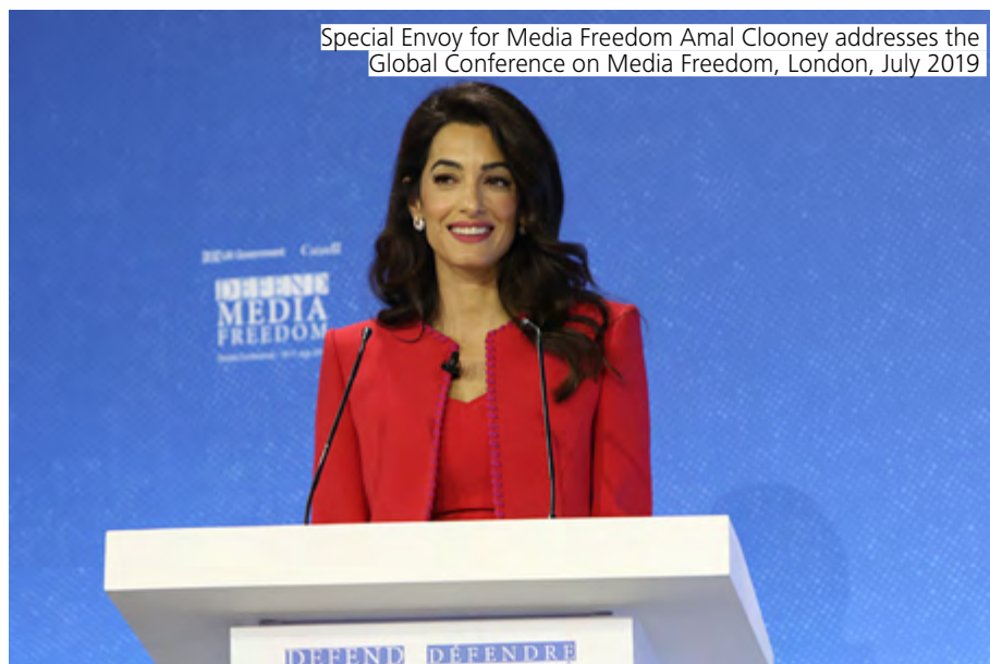
Special Envoy for Media Freedom Amal Clooney addresses the Global Conference on Media Freedom, London, July 2019

Global Conference for Media Freedom, the UK announced plans to develop its own domestic National Action Plan.