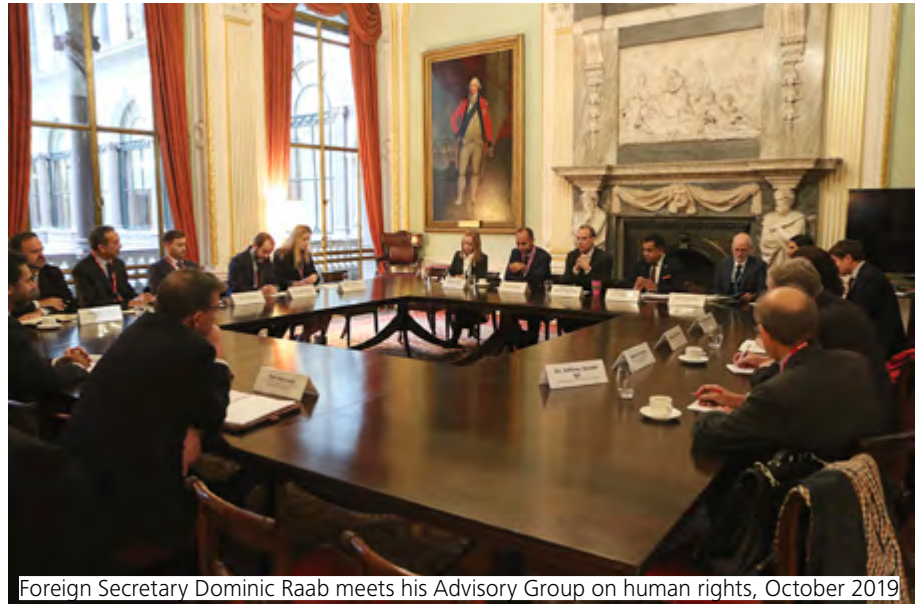
Foreign Secretary Dominic Raab meets his Advisory Group on human rights, October 2019

One of the greatest threats to democracy comes from hostile state activity in cyber space. In 2019, the then Foreign Secretary, Jeremy Hunt, delivered a speech that warned of the damage which authoritarian states and cyber-attacks do to the credibility of the democratic process. [2] Reflecting the UK's position as a global leader in technology, we engaged partners across the UK government and civil society on cybersecurity, disinformation, and the erosion of human rights online. From 2017/18 until 2019/20, we have spent £62 million, to reduce the impact of Russian disinformation across wider Europe, through our Counter Disinformation and Media Development programme, funded by the Conflict, Stability and Security Fund (CSSF). We have also used our work as a member of the Freedom Online Coalition (FOC) to defend a free, open, and secure internet, and to promote the protection of human rights online in the same way as they are protected offline. The Prime Minister, Boris Johnson, reinforced this message in his speech to the UN General Assembly in September. [3]