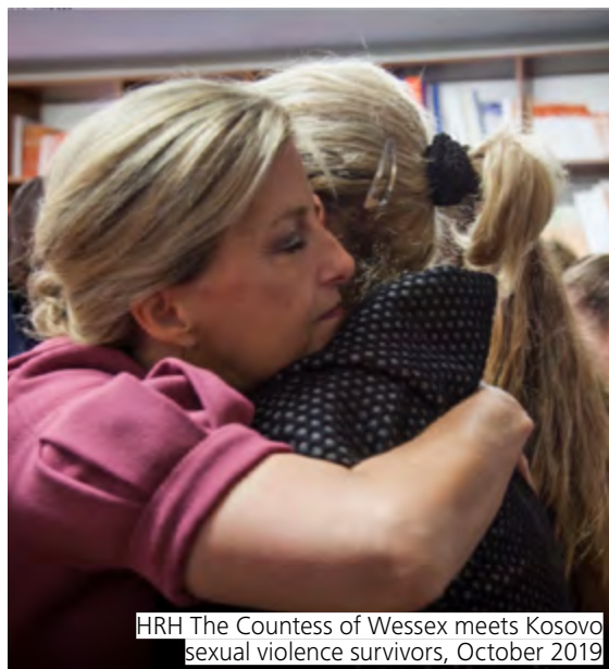
HRH The Countess of Wessex meets Kosovo sexual violence survivors, October 2019

next phase of the programme, which will invest up to £67.5 million to scale up proven interventions, and to conduct further research in conflict and humanitarian settings, to help stop violence against one million of the world's poorest women and girls.