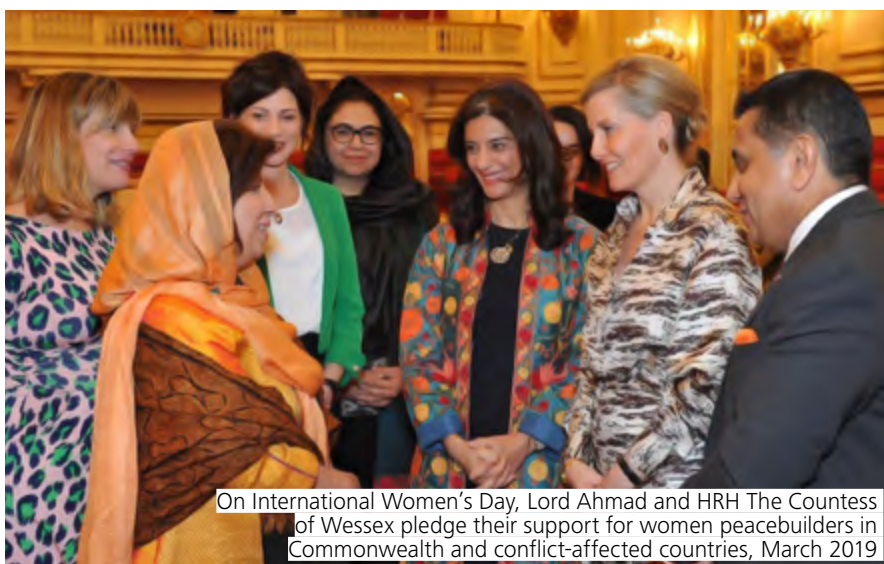
On International Women's Day, Lord Ahmad and HRH The Countess of Wessex pledge their support for women peacebuilders in Commonwealth and conflict-affected countries, March 2019

The UK continued to support the Women Mediators across the Commonwealth (WMC) initiative, with 48 members from 21 Commonwealth countries building peace around the world. At the UN General Assembly, the UK supported the launch of the Global Alliance of Women Mediator Networks to amplify voices, and provide access and accountability to members.