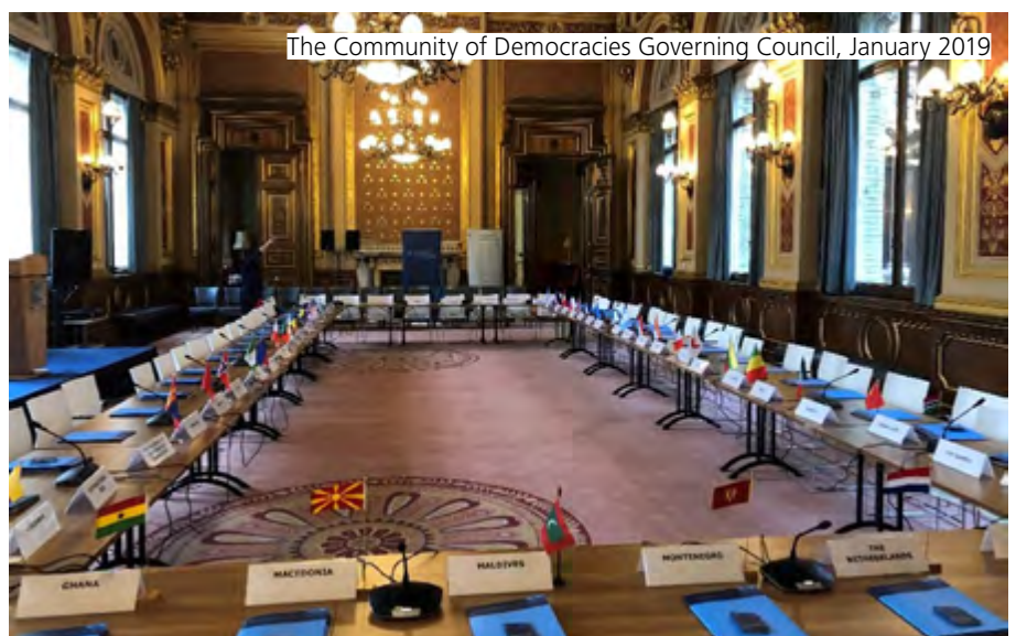
The Community of Democracies Governing Council, January 2019

In January, we hosted the Governing Council in London to discuss the importance of democratic participation, devolution in the UK, media freedom,