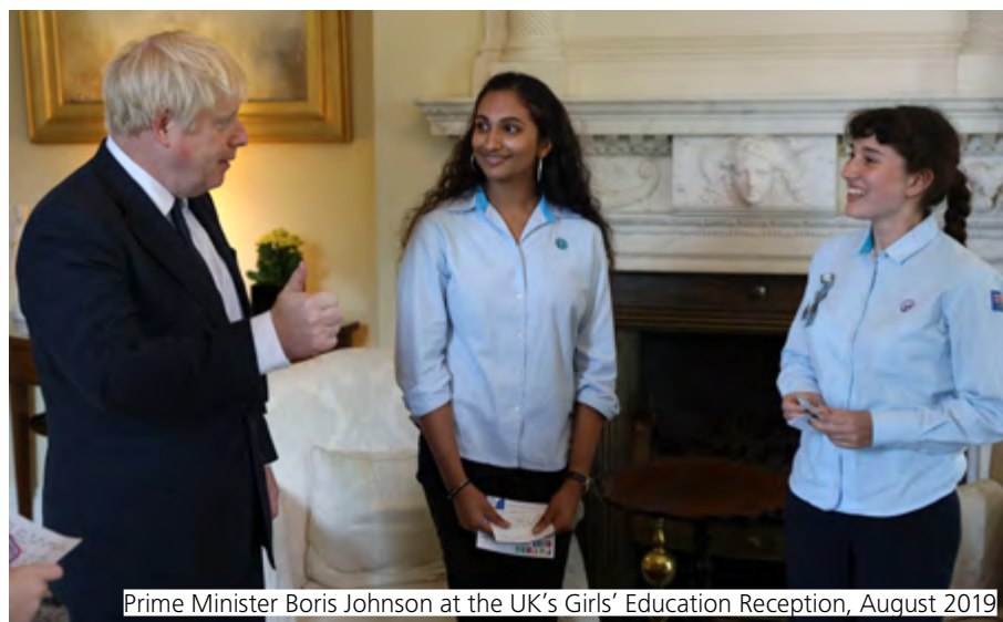
Prime Minister Boris Johnson at the UK's Girls' Education Reception, August 2019