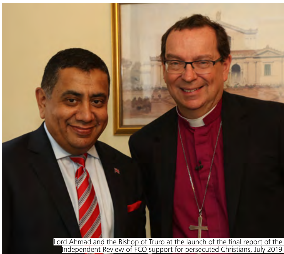
Lord Ahmad and the Bishop of Truro at the launch of the final report of the Independent Review of FCO support for persecuted Christians, July 2019

War to issue visas to thousands of Jews trying to escape Germany.