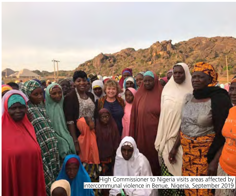
High Commissioner to Nigeria visits areas affected by intercommunal violence in Benue, Nigeria, September 2019