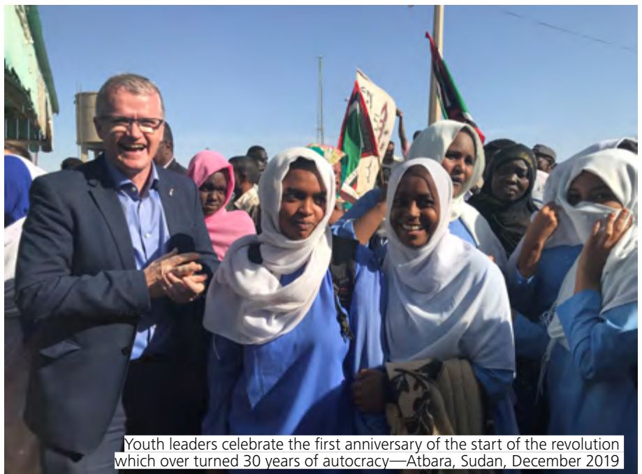
Youth leaders celebrate the first anniversary of the start of the revolution which over turned 30 years of autocracy—Atbara, Sudan, December 2019

2019 was a year of significant change in Sudan. A mass protest movement led to the end of President Bashir's 30-year rule and to the establishment of a civilian-led transitional government, whose objective was to pave the way for democracy. The human rights situation was mixed. Serious human rights violations accompanied the