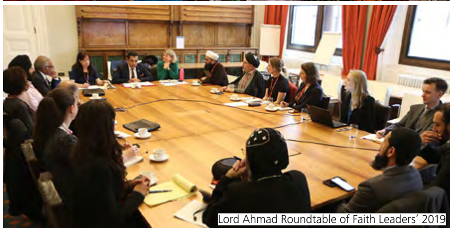
Lord Ahmad Roundtable of Faith Leaders' 2019

Christchurch, New Zealand , to the Easter Sunday attacks in Sri Lanka , and the targeting of the Poway Synagogue in the US . The UK has worked closely with all countries concerned. We are now a leading partner on New Zealand's Christchurch Call to Action. The then Minister of State for Security, Ben Wallace, visited Sri Lanka after the attacks there to offer UK support, and to encourage a response that would bring communities together and ensure the protection of members of minority groups.