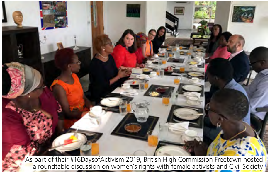
As part of their #16DaysofActivism 2019, British High Commission Freetown hosted a roundtable discussion on women's rights with female activists and Civil Society

Following the successful 2018 PSVI Film Festival, we funded capacity building for young filmmakers in Goma