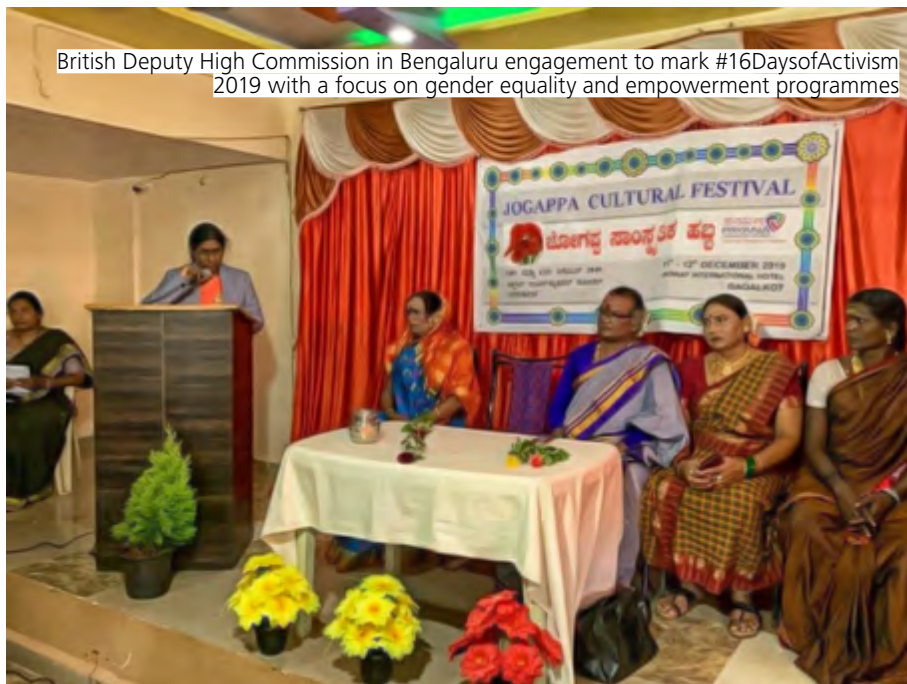
British Deputy High Commission in Bengaluru engagement to mark #16DaysofActivism 2019 with a focus on gender equality and empowerment programmes

Equality, the UK continues to lead and invest in girls' education, sexual and reproductive health and rights (SRHR), women's political and economic empowerment, and ending violence against women and girls. The FCO, DFID, Conflict, Stability and Security Fund (CSSF), and the Stabilisation Unit have developed a suite of guidance and training products to mainstream gender equality across the UK government's work.