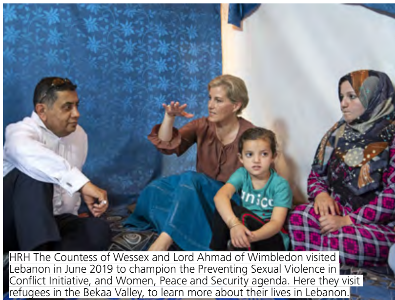
HRH The Countess of Wessex and Lord Ahmad of Wimbledon visited Lebanon in June 2019 to champion the Preventing Sexual Violence in Conflict Initiative, and Women, Peace and Security agenda. Here they visit refugees in the Bekaa Valley, to learn more about their lives in Lebanon.