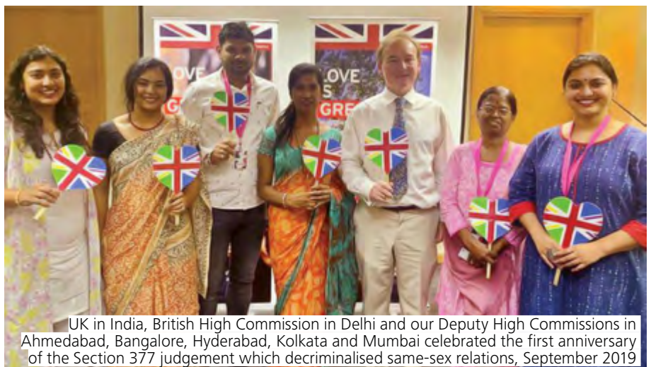
UK in India, British High Commission in Delhi and our Deputy High Commissions in Ahmedabad, Bangalore, Hyderabad, Kolkata and Mumbai celebrated the first anniversary of the Section 377 judgement which decriminalised same-sex relations, September 2019

With a core objective to increase respect for equality and non-