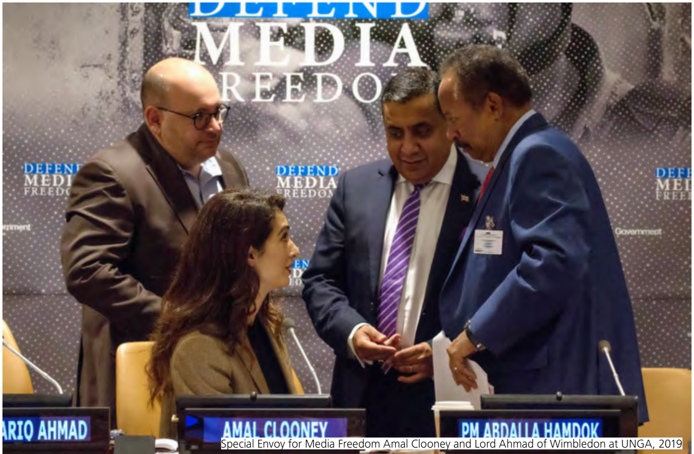
Special Envoy for Media Freedom Amal Clooney and Lord Ahmad of Wimbledon at UNGA, 2019

Other events and conferences were held throughout the year focussing on challenges and developments in specific regions and countries. The UK made statements in multilateral fora, including the Human Rights Council, OSCE, Council of Europe, and the Commonwealth, encouraging partners to do more to translate collective commitments into tangible action. UK Ministers, Ambassadors and High Commissioners, and diplomatic missions lobbied privately and publicly on specific individual cases and situations of concern.