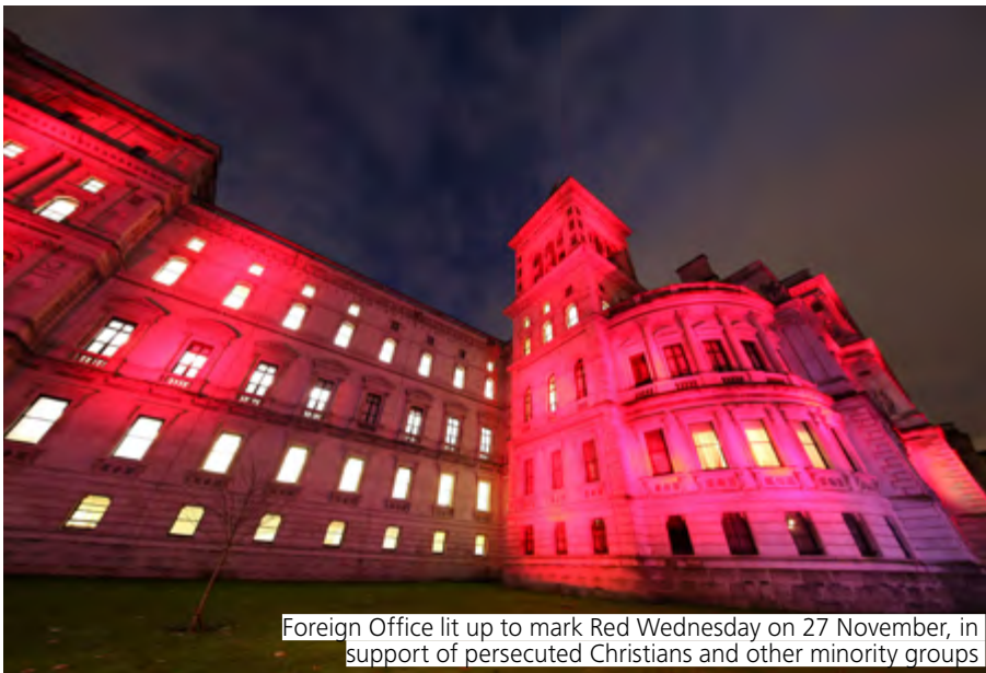
Foreign Office lit up to mark Red Wednesday on 27 November, in support of persecuted Christians and other minority groups

interfaith workshops and social action projects in three cities in India in 2019.