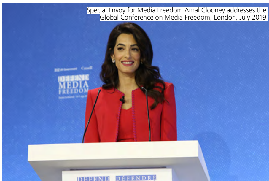
Special Envoy for Media Freedom Amal Clooney addresses the Global Conference on Media Freedom, London, July 2019

Global Conference for Media Freedom, the UK announced plans to develop its own domestic National Action Plan.