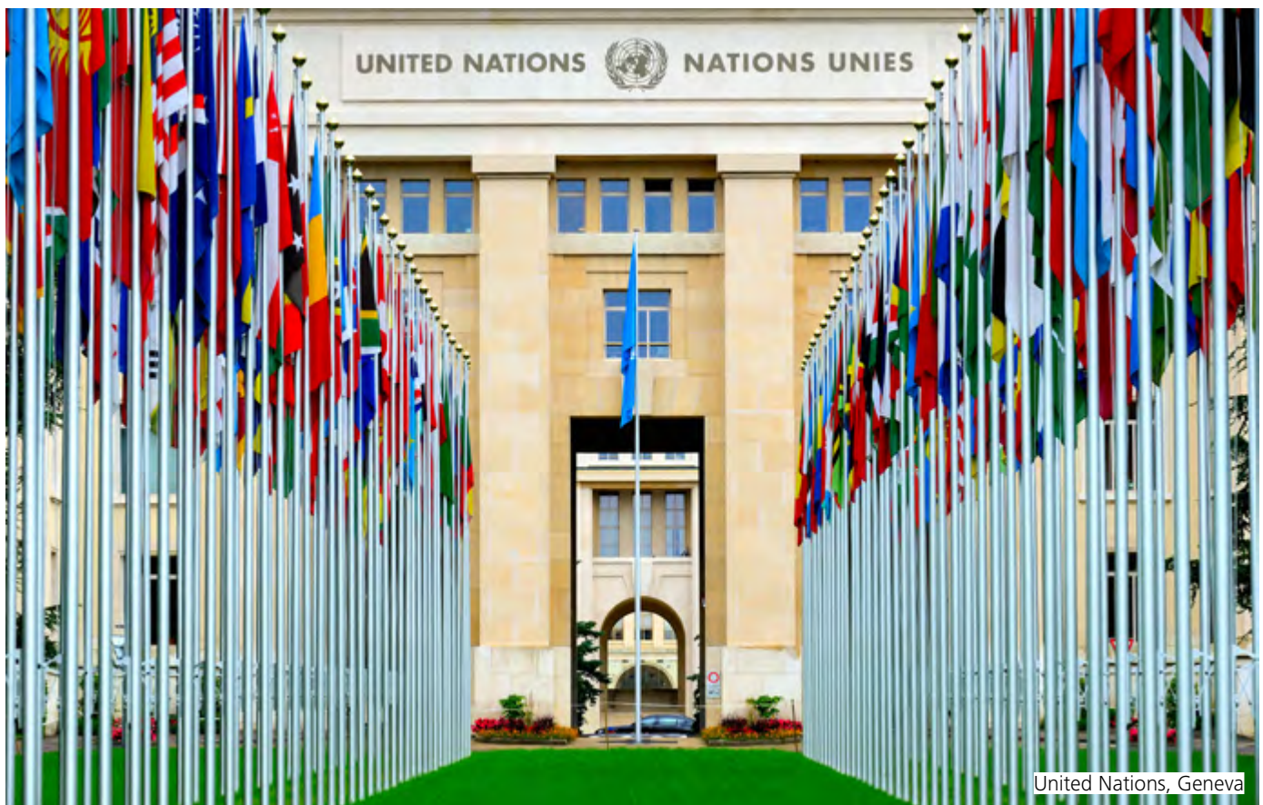
United Nations, Geneva

Our campaign pledges [24] for the 2021-23 term reflect UK priorities at home and overseas, draw on our tradition of