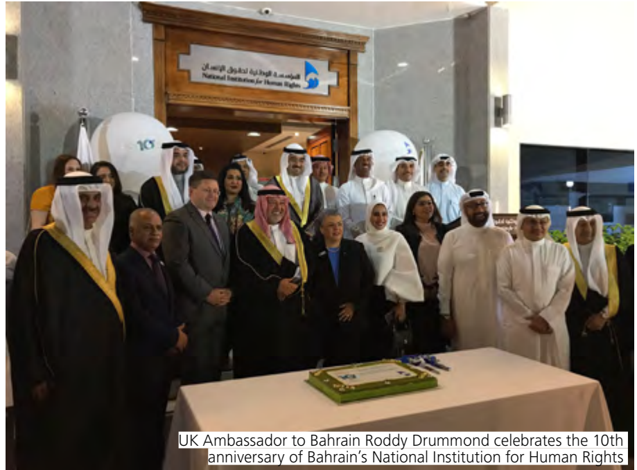
UK Ambassador to Bahrain Roddy Drummond celebrates the 10th anniversary of Bahrain's National Institution for Human Rights

Bahrain dropped one place in the World Press Freedom Index, to 167