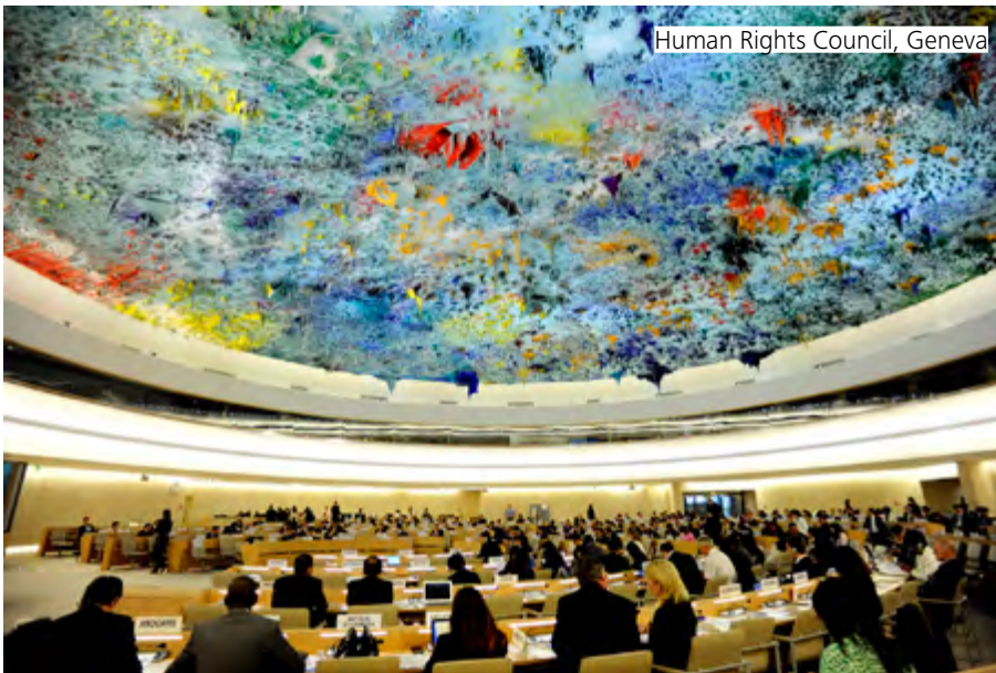
Human Rights Council, Geneva

supporting democratic and inclusive values, and focus on some of the most prominent challenges which the international community faces. They are: