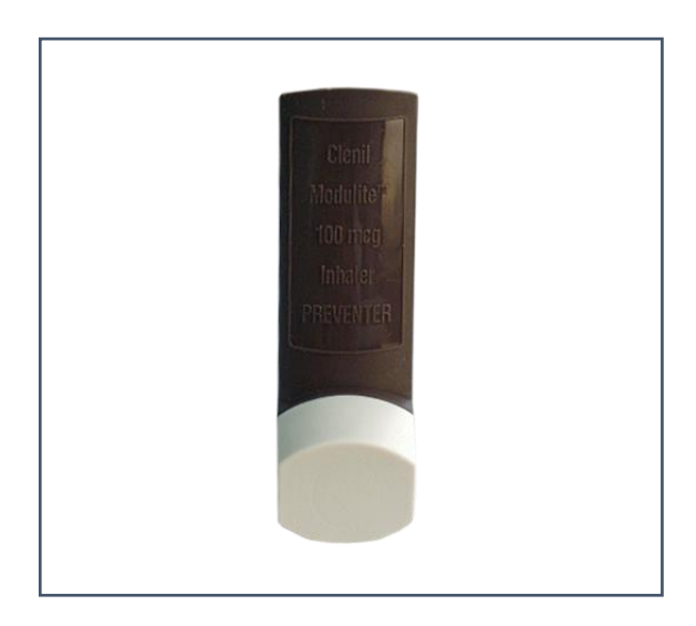
Clenil 100mcg inhaler from a regular batch