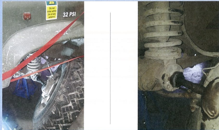
Figs 1. The images above show typical failure mode.