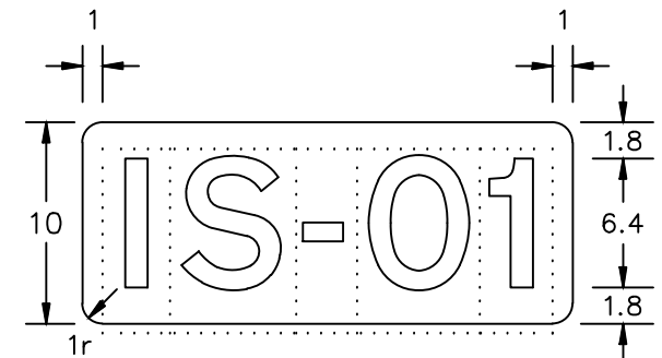
TYPICAL CODE IDENTIFIER

NOTE : The characters shown are from the Transport Medium alphabet. The characters and the tile may be varied in size and may be in any contrasting colours.