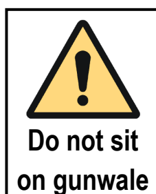
Figure 5 Do not sit or stand on the gunwale (using ISO 7010 – W001 “General warning”)