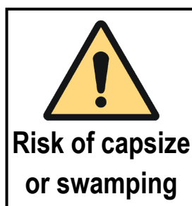
Figure 4 Dinghy is vulnerable to capsize or swamping

NOTE The use of water containers instead of metallic test weights will give a less advantageous result.