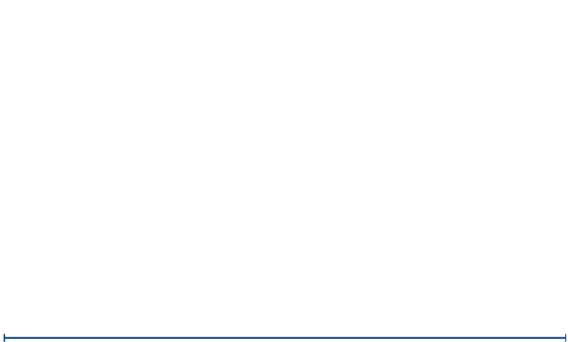
Figure 1: Current monitoring locations within the RBKC