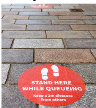
Signage to promote social distancing measures