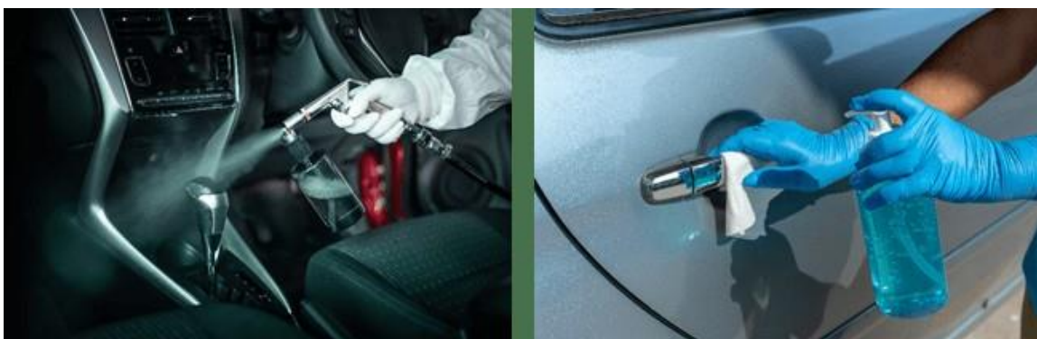
Cleaning of common contact points