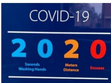
Signage to promote hygiene and social distancing measures