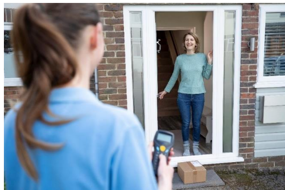
Contact free delivery