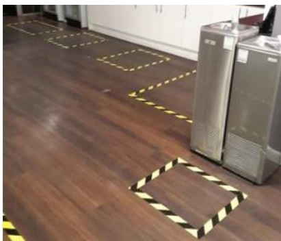
Distancing markers in a kitchen