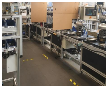
Temporary board dividers