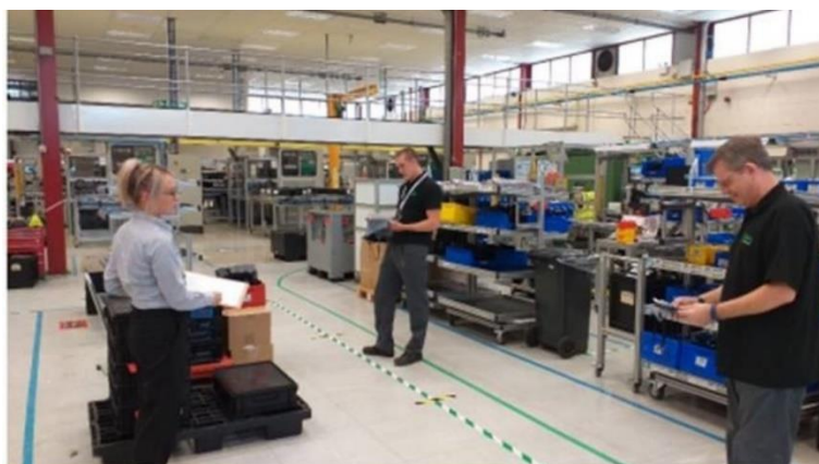
Shift briefing with social distancing