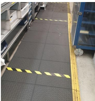
2m floor markings