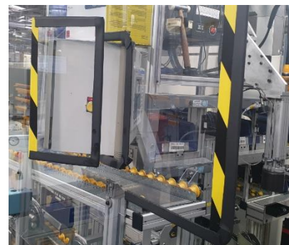
Perspex dividers with edge marking