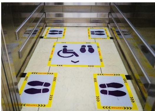
Example lift practices