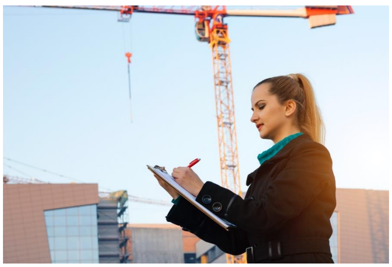
Visitor signing in