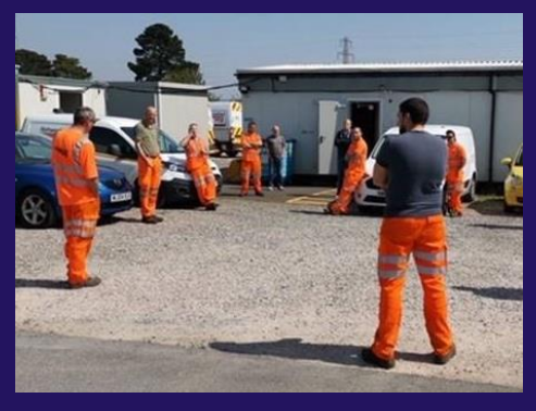
Social distancing during meetings outdoors