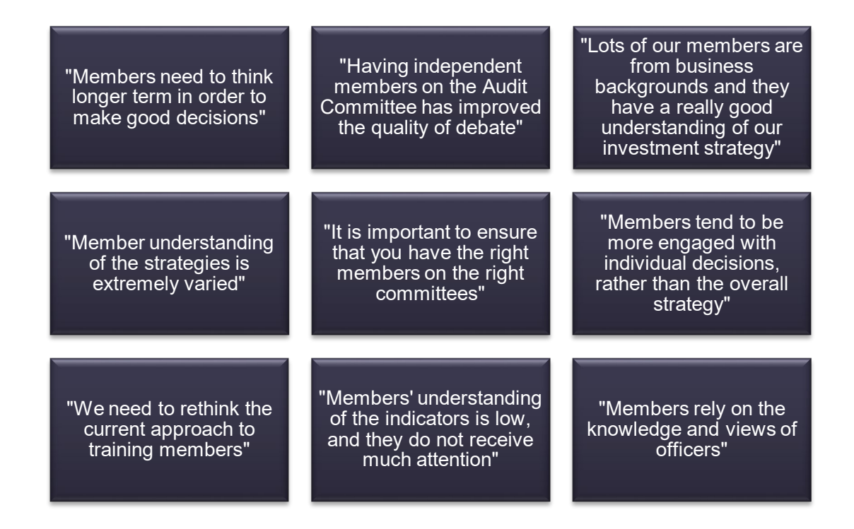
Figure 3: Feedback from senior finance officers regarding member engagement

shown at Figure 3 reflects the range of differing responses received when the topic of member engagement in investment and borrowing decisions was explored with senior finance officers.