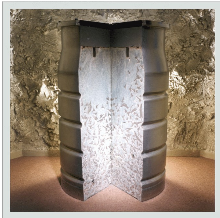
Figure 1 Typical 500 litre Drum Waste Package showing grout cap

Whilst the inclusion of a grout cap is not explicitly specified in the GWPS, it is generally believed that a number of advantages to overall waste package performance will result if one is included. However, these advantages are not universal and it may be that, for certain waste and wasteform types, no such advantage would result and the cost of including a grout cap would not be justified. Furthermore there may be cases where the presence of a grout cap may be deleterious to the overall performance of a waste package.