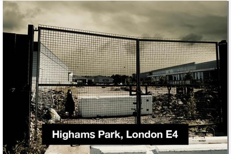
Highams Park, London E4