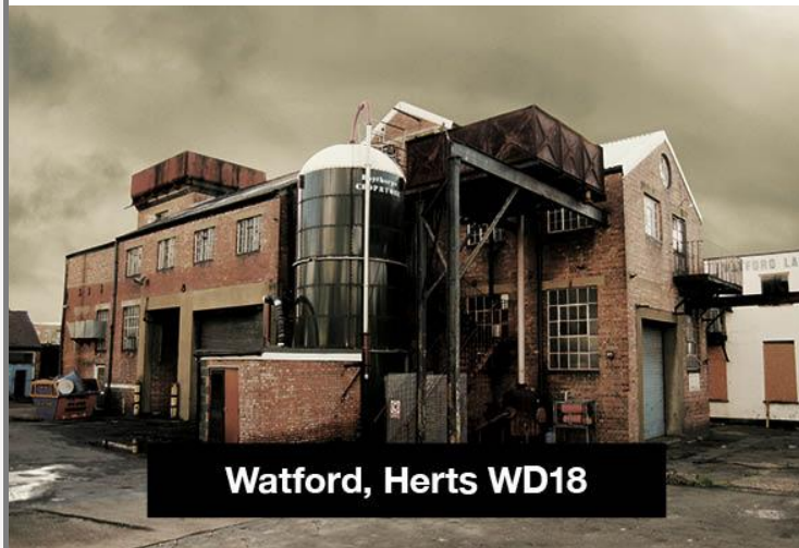
Watford, Herts WD18