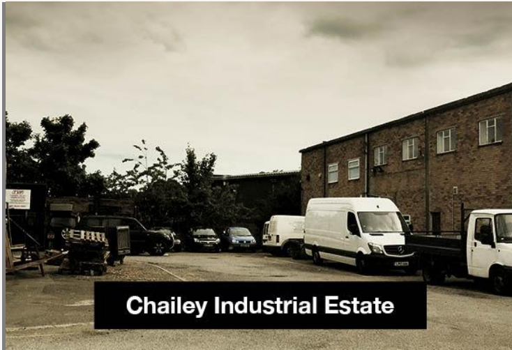
Chailey Industrial Estate