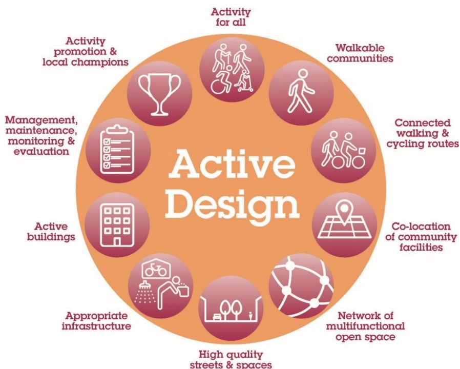
Figure 3. Active Design principles (57)