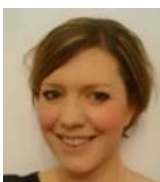
Katherine Cowell Interim Regional Schools Commissioner (North)