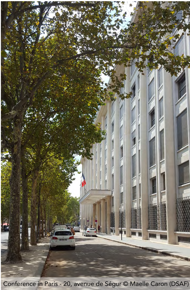
Conference in Paris - 20, avenue de Ségur

Conference on 15 November 2019 in Paris: "Twenty years of reparation for anti-semitic spoliations during the Occupation: between compensation and restitution"