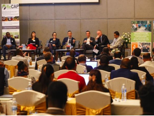
Deliberations at the second ReCAP Inter-Regional Implementation Meeting, 25-27 February 2019, Kathmandu, Nepal