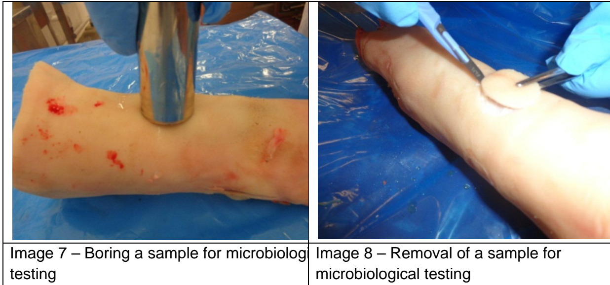
Table 2. Sample collection method