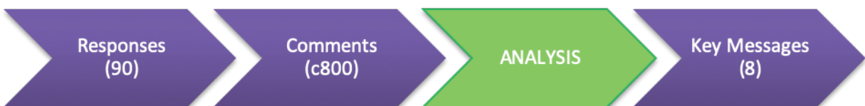
Figure 2: Where the 8 Key Messages came from

Having analysed the 90 separate contributions, we noted around 800 individual comments or points that had been raised by respondents. Our analysis allowed us to identify any common themes and a list of what we deemed to be the 'Key Messages' raised during the consultation processes in both England and Wales. We took from the responses 8 Key Messages.